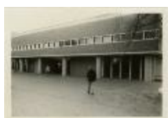
Clifton M. Miller Library (MS 0061-24-14-006)