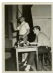
Two students at Senior Auction (MS 0061-09-18-002)