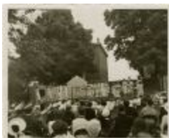
Students on pageant stage (MS 0061-09-07-004)