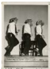
Fraternity brothers at Stunt Night (MS 0061-09-18-012)