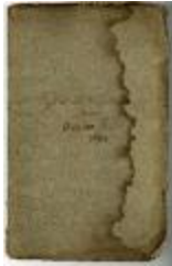
Ezekiel F. Chambers Esq. Docket October Term 1822 (MS 0011-1822-10-001)