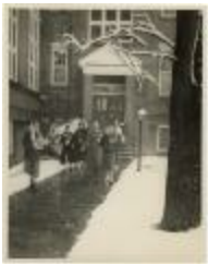
Students leaving William Smith Hall during snow (MS_0061-08-09-036)