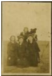
Washington College Normal department students and their friends (MS 0089-01-01-005)