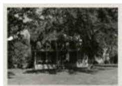
McAlpin House (demolished) (MS 0061-24-13-001)