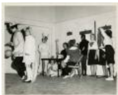
"Alice in Wonderland" at Stunt Night (MS 0061-09-18-018)