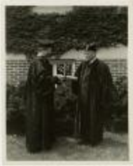
Anna Eleanor Roosevelt with her honorary degree (MS 0061-03-17-003)