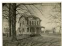
Hodson House/Phi Sigma Phi House (MS 0061-24-03-001)