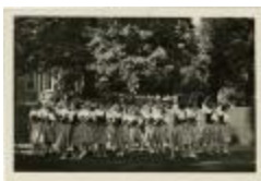
Costumed students dance (MS 0061-09-07-003)