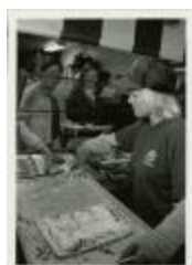
Pizza in the Dining Hall (MS 0061-26-18-009)