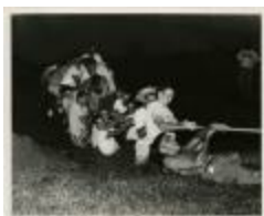
Students playing Tug-of-War (MS 0061-10-04-001)