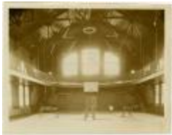
Cain Gym, interior (MS 0061-22-11-023)