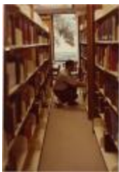
Student in the stacks (MS 0061-24-14-003)