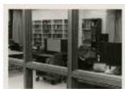
Students in Miller Library (MS 0061-24-14-024)