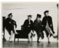
Faculty Stunt Night (MS 0061-09-18-023)