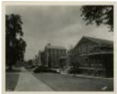
Cain Gym (MS 0061-22-11-019)