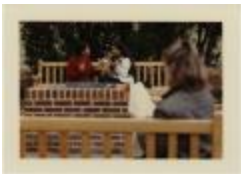
Students on Cater Walk (MS 0061-20-02-064)