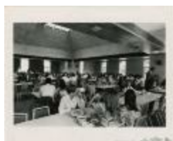
Students in the Dining Hall (MS 0061-26-18-023)