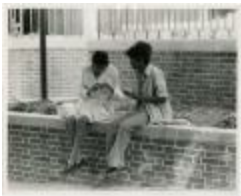
Students on Campus (MS 0061-19-08-042)