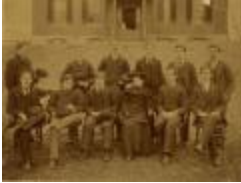
Class of 1895 (MS 0061_OS_class of 1895)