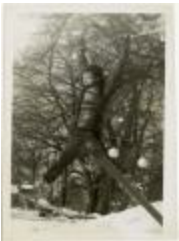
Ski jump (MS_0061-08-14-006)