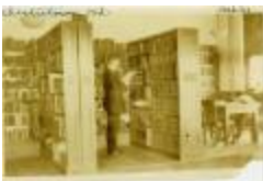
Library in William Smith Hall (MS 0061-25-12-001)