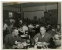
Students in Hodson Hall (MS 0061-26-18-007)