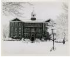
William Smith Hall in the snow (MS_0061-08-09-037)