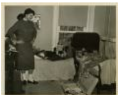
Student standing in her dorm room (MS 0061-19-04-004)