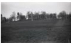
Hill Dorms and the campus green (MS 0118-004)