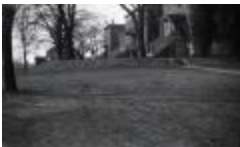
Hill Dorms (MS 0118-002)