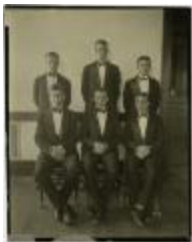
Cotillion Club Committee (MS 0061-11-23-002)