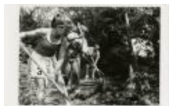
Students during Casey Time (MS 0061-03-03-021)