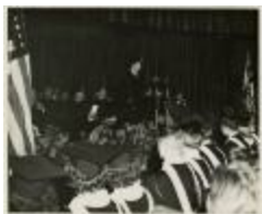
Eleanor Roosevelt giving the commencement address (MS 0061-03-17-008)