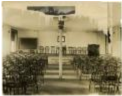
Chapel, West Hall (MS 0061-23-21-042)