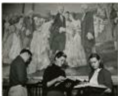
Students reading in Bunting Library (MS 0061-24-11-010)