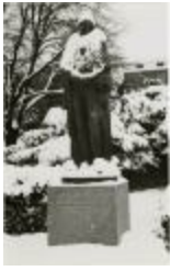
George Washington statue in snow (MS_0061-08-09-033)