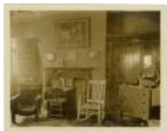
Typical Room in Reid Hall (MS 0061-24-19-012)