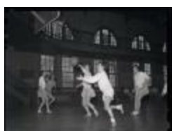
Girls Basketball (MS 0150-01-25)