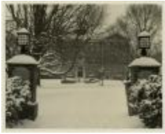
William Smith Hall in the snow (MS_0061-25-11-069)