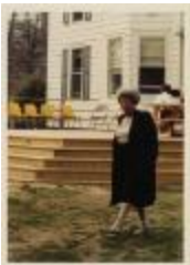
Toni Morrison at the Rose O'Neill Literary House (MS 0061-17-05-008)