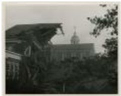
Demolition of Cain Gym (MS 0061-22-12-001)