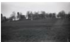
Hill Dorms and the campus green (MS 0118-004)