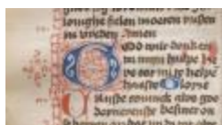
Middle Dutch Psalter illuminated Capital (MS 0146-01_01)