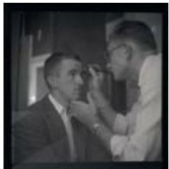
The Washington Players (MS 150-01-08)