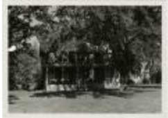
McAlpin House (demolished) (MS 0061-24-13-001)