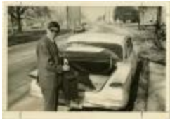
Student with suitcase in front of car (MS 0061-19-07-067)