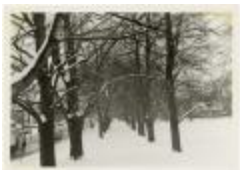
Tree-lined pathway in snow (MS_0061-25-04-048)