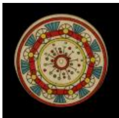
Ludoscope disc (MS 0073-01-01-002)