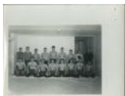
Wrestling Team (MS 0150-01-29)