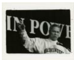
Colin Powell speaking (MS 0061-17-19-006)