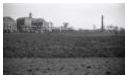
Baseball game (MS 0118-012)