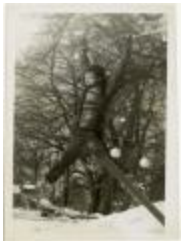
Ski jump (MS_0061-08-14-006)