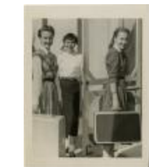
Three students during Freshman Week (MS 0061-06-17-001)