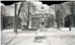
Hill Dorms in the snow (MS_0119-01-073)