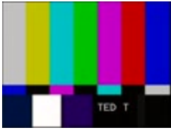
Washington's Birthday Convocation (MS 0058-1999-001)