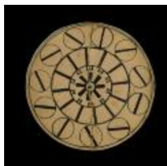
Ludoscope disc (MS 0073-01-01-012)