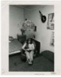
Student reads in her dorm room (MS 0061-19-04-007)