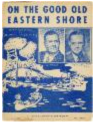
"On the Good Old Eastern Shore" (MS 0094-01-01-010)