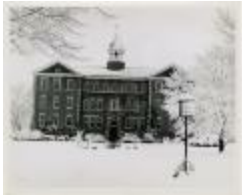
William Smith Hall in the snow (MS_0061-08-09-037)