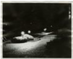
Night snow (MS_0061-22-14-060)