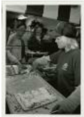
Pizza in the Dining Hall (MS 0061-26-18-009)