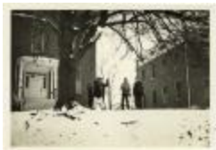
Students outside West Hall in the snow (MS_0061-08-09-030)