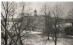
William Smith Hall in the snow (MS_0119-01-082)