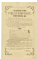
Chestertown Female Seminary advertisement (MS 0091-01-01-001)