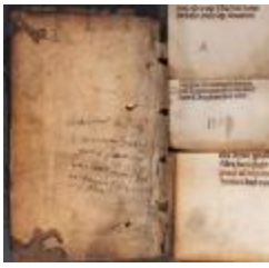
Middle Dutch Psalter flyleaves (MS 0146-01_10)