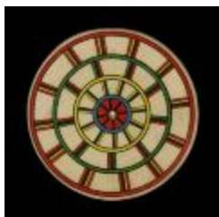
Ludoscope disc (MS 0073-01-01-003)