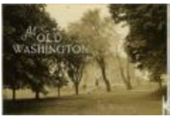
"At Old Washington" (MS 0061-25-11-021)