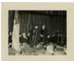
Anna Eleanor Roosevelt receiving her honorary doctorate of law (MS 0061-03-17-010)