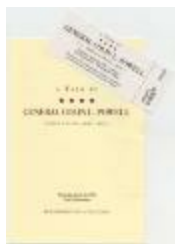
Program and ticket for Colin Powell speech (MS 0059-65-16-Ticket and program)