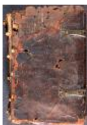
Middle Dutch Psalter (MS 0146-001)