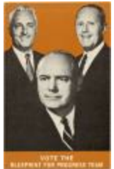
"Vote the Blueprint for Progress Team" postcard (MS 0162-01-01-001)