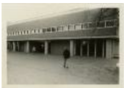
Clifton M. Miller Library (MS 0061-24-14-006)