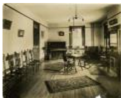
Parlor of Normal Hall (MS 0061-24-19-008)