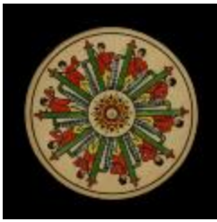
Lidoscope disc (MS 0073-01-01-004)