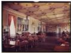
George A. Bunting Library (MS 0061-24-11-003)