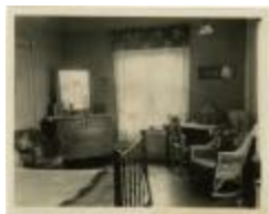
Room in Reid Hall (MS 0061-24-19-010)