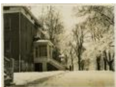
Hill Dorms in the snow (MS_0061-23-21-038)