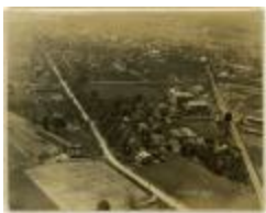
Aerial view of Washington College campus (MS 0061-22-02-006)