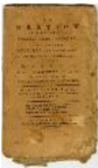
"An Oration in Memory of General Montgomery" by William Smith (WAC-003-001-01-13-001)