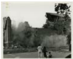
Demolition of Cain Gym (MS 0061-22-12-004)