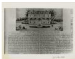
News Article on "Normal Hall" (MS 0061-24-19-007)