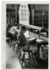
Students studying in Bunting Library (MS 0061-24-11-006)