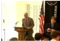
The Senatorial Colloquy on American History and Politics at Washington College, Session 02 (MS 0058_2007-2008_Senate_02)