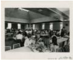
Students in the Dining Hall (MS 0061-26-18-023)