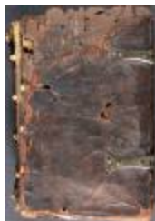
Middle Dutch Psalter cover (MS 0146-01_02)