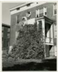
Dorm decorated for Homecoming game (MS 0061-07-15-038)