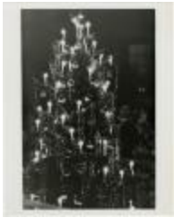
Christmas tree (MS_0061-08-09-035)