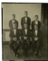
Cotillion Club Committee (MS 0061-11-23-002)