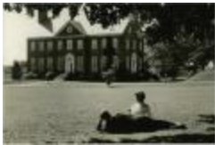
Bunting Hall (MS 0061-22-07-020)