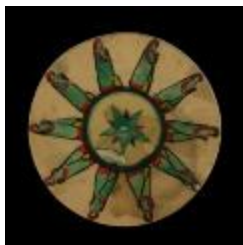
Ludoscope disc (MS 0073-01-01-014)