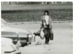
Student moving out (MS 0061-19-08-004)