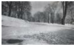
Snow covering the campus green (MS 0118-007)