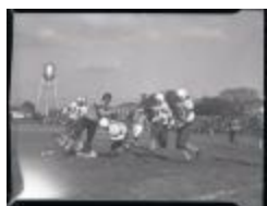
Randolph-Macon vs. Washington College football game (MS 0150-01-27)