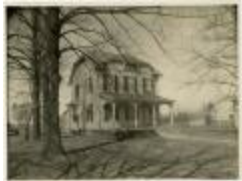
Hodson House/Phi Sigma Phi House (MS 0061-24-03-001)