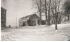
Building in the snow (MS_0119-01-067)