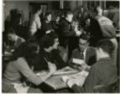
Students at lunch (MS 0061-19-06-012)