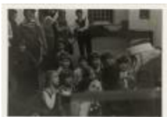
Santa Claus and children (MS_0061-28-09-025)