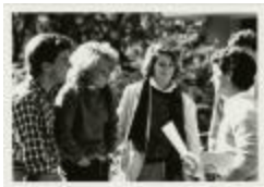
Group of students on campus (MS 0061-20-01-011)