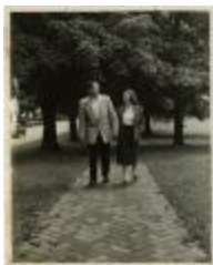
'The Walk' on Washington College Campus (MS 0061-18-21-024)