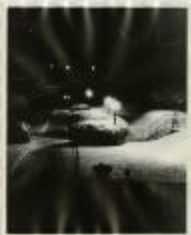
Cater Walk at night (MS_0061-22-14-061)