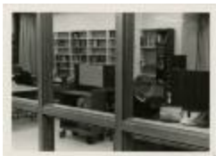
Students in Miller Library (MS 0061-24-14-024)