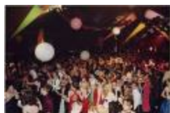
Washington's Birthday Ball (MS 0061-03-01-022)