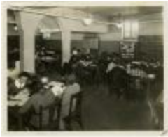
Library in the basement of William Smith Hall (MS 0061-25-12-002)