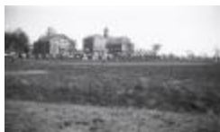
Baseball game (MS 0118-011)