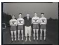
Relay Team (MS 0150-01-28)