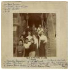
Co-Eds of Washington College (MS 0061-18-17-004)