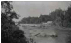
Unidentified location (MS 0118-009)