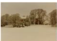
View north from Campus Ave. of South Campus (MS_0061-25-04-051)