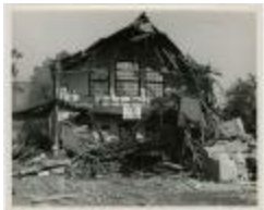
Demolition of Cain Gym (MS 0061-22-12-003)