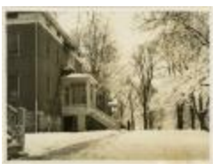
Hill Dorms in the snow (MS_0061-26-16-046)