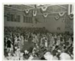
Washington's Birthday Ball (MS 0061-03-01-003)