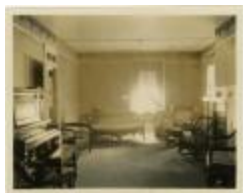
Social Room in Reid Hall (MS 0061-24-19-011)