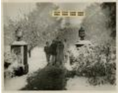
Students walking through snow (MS_0061-19-07-102)