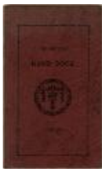
Washington College Freshman Hand Book, 1924-1925 (Freshman_Handbook_1924-1925)