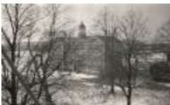
William Smith Hall in the snow (MS_0119-01-082)