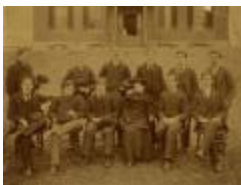
Class of 1895 (MS 0061_OS_class of 1895)