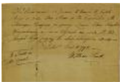
Schuylkill and Susquehanna Navigation Company note (WAC-003-001-01-19-001)