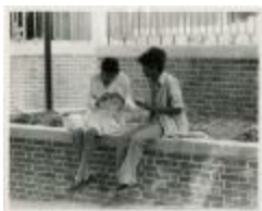
Students on Campus (MS 0061-19-08-042)