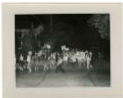
Pep rally for football game against Johns Hopkins (MS 0150-01-16)