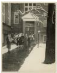
Students leaving William Smith Hall during snow (MS_0061-08-09-036)