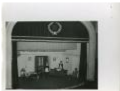
Production of Night Must Fall by Washington Players (MS 0150-01-17)