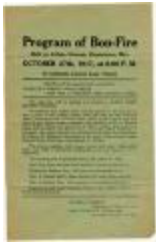
Program of Bon-Fire (MS 0173-01-001)