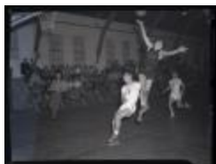
Basketball game (MS 0150-01-24)