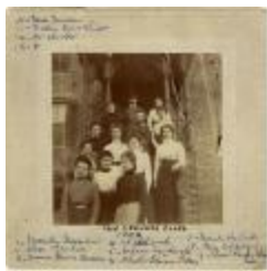
Co-Eds of Washington College (MS 0061-18-17-004)