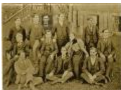
Class of 1895 (MS 0061-18-17-003)