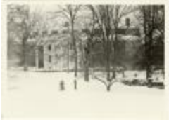
Reid Hall in the snow (MS_0061-25-04-054)