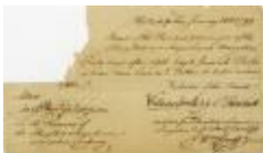
Schuylkill and Susquehanna Navigation Company receipt (WAC-003-001-01-19-002)