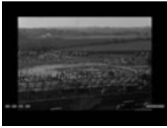
Sesquicentennial and Bicentennial celebrations (MS 0058-1932-002)