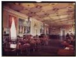
George A. Bunting Library (MS 0061-24-11-003)