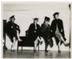
Faculty Stunt Night (MS 0061-09-18-023)