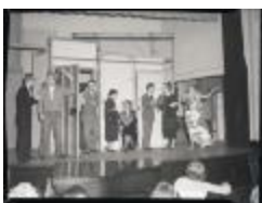
Washington Players production of The Torch-Bearers (MS 0150-01-19)