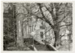
Hill Dorms during snow (MS_0061-26-16-031)