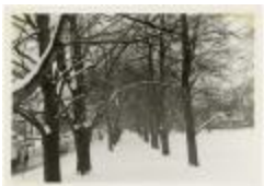
Tree-lined pathway in snow (MS_0061-25-04-048)