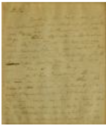
William Paca letter (MS 0039-01-01-001)