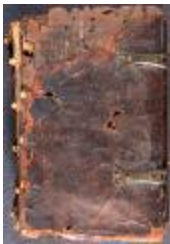
Middle Dutch Psalter (MS 0146-001)