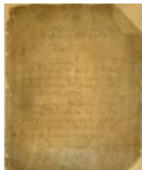
Dedication of Washington College (WAC-003-001-01-06-001)