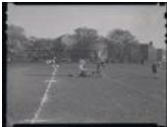
Fraternity stunt during Homecoming football game (MS 0150-01-14)