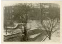
View of Hill Dorms in the snow (MS_0061-26-16-015)