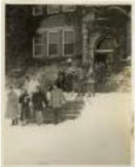
Students leaving William Smith Hall (MS_0061-21-10-012)