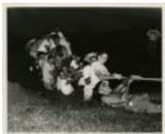
Students playing Tug-of-War (MS 0061-10-04-001)