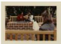
Students on Cater Walk (MS 0061-20-02-064)