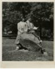
Students at "the Rock" (MS 0061-18-21-026)