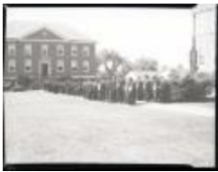
Graduation exercises (MS 0150-01-11)