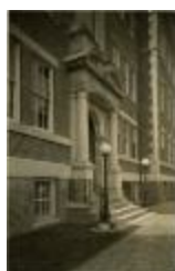
Entrance to William Smith Hall (MS 0061-25-11-026)