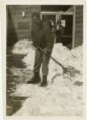
Man shoveling snow (MS_0061-25-04-102)