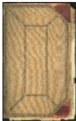
Sophie Kerr's scrapbook/commonplace book. (MS 0029-01-10-001)