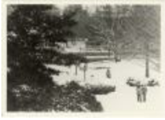
A couple in the snow (MS_0061-25-04-058)