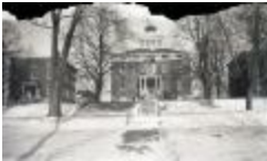
Hill Dorms in the snow (MS_0119-01-073)