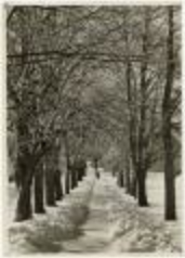
"The Walk" in the snow (MS_0061-25-04-060)