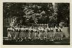
Costumed students dance