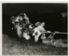
Students playing Tug-of-War (MS 0061-10-04-001)