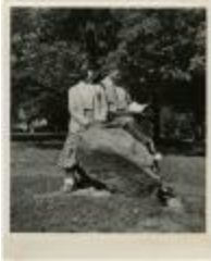
Students at "the Rock" (MS 0061-18-21-026)