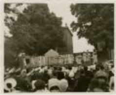
Students on pageant stage (MS 0061-09-07-004)