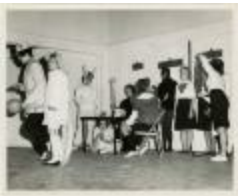
"Alice in Wonderland" at Stunt Night (MS 0061-09-18-018)