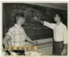
Spanish class (MS 0061-19-01-029)