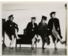
Faculty Stunt Night (MS 0061-09-18-023)