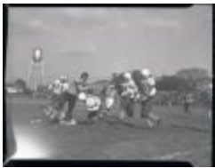
Randolph-Macon vs. Washington College football game (MS 0150-01-27)