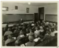
Students attending a lecture (MS 0061-19-01-019)