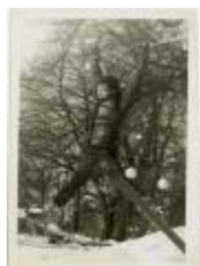
Ski jump (MS_0061-08-14-006)