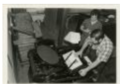
Washington College Literary House Press (MS 0061-25-04-010)