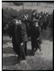
Convocation ceremony (MS 0150-01-12)