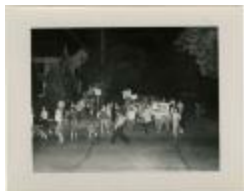
Pep rally for football game against Johns Hopkins (MS 0150-01-16)