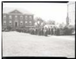
Graduation exercises (MS 0150-01-11)