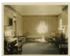
Social Room in Reid Hall (MS 0061-24-19-011)