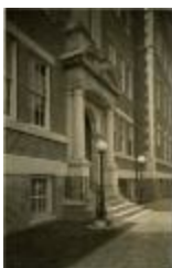
Entrance to William Smith Hall (MS 0061-25-11-026)