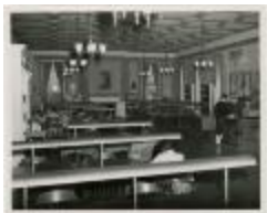
George A. Bunting Library (MS 0061-24-11-012)