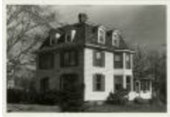
Bell House (MS 0061-25-04-004)