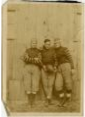
Three football players (MS 0084-01-01-002)