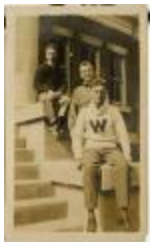
Three students on steps (MS 0084-01-01-004)