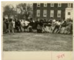
Students play Tug-of-War (MS 0061-10-04-008)