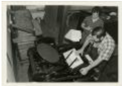
Washington College Literary House Press (MS 0061-25-04-010)