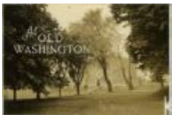
"At Old Washington" (MS 0061-25-11-021)