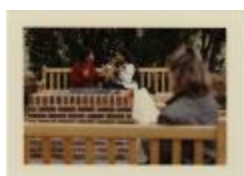
Students on Cater Walk (MS 0061-20-02-064)