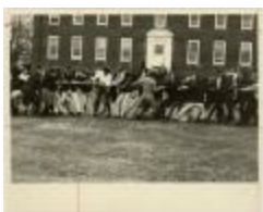
Students playing Tug-of-War (MS 0061-10-04-007)