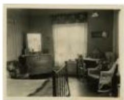
Room in Reid Hall (MS 0061-24-19-010)