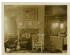
Typical Room in Reid Hall (MS 0061-24-19-012)