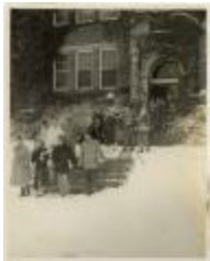
Students leaving William Smith Hall (MS_0061-21-10-012)