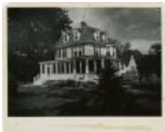
Rose O'Neill Literary House (MS 0061-25-04-012)