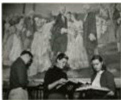
Students reading in Bunting Library (MS 0061-24-11-010)