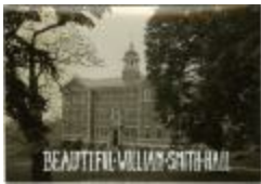
"Beautiful William Smith Hall" (MS 0061-25-11-019)