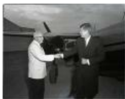
John F. Kennedy, arrives in Chestertown (MS 0045-253)