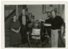
Washington College Literary House Press (MS 0061-25-04-005)