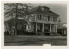
Richmond House (demolished) (MS 0061-25-03-001)