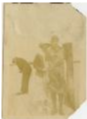
On the dock (MS 0084-01-01-008)