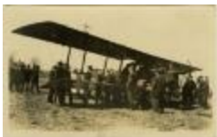
Biplane and crowd (MS 0083-01-01-005)