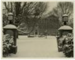
William Smith Hall in the snow (MS_0061-25-11-069)