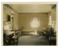
Social Room in Reid Hall (MS 0061-24-19-011)