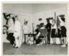
"Alice in Wonderland" at Stunt Night (MS 0061-09-18-018)