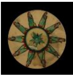
Ludoscope disc (MS 0073-01-01-014)