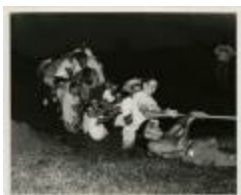
Students playing Tug-of-War (MS 0061-10-04-001)