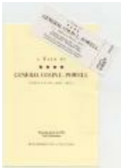
Program and ticket for Colin Powell speech (MS 0059-65-16-Ticket and program)