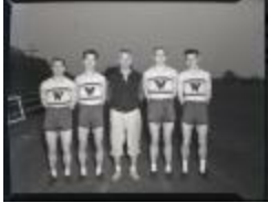
Relay Team (MS 0150-01-28)