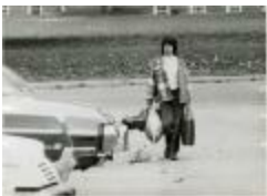
Student moving out (MS 0061-19-08-004)