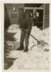
Man shoveling snow (MS_0061-25-04-102)