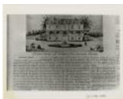
News Article on "Normal Hall" (MS 0061-24-19-007)