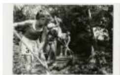
Students during Casey Time (MS 0061-03-03-021)