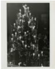
Christmas tree (MS_0061-08-09-035)