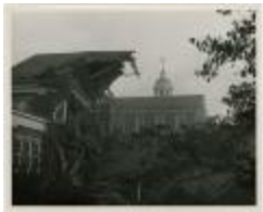
Demolition of Cain Gym (MS 0061-22-12-001)