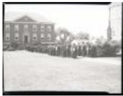
Graduation exercises (MS 0150-01-11)