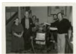
Washington College Literary House Press (MS 0061-25-04-005)