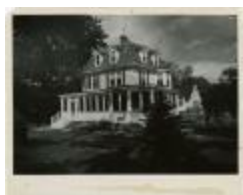
Rose O'Neill Literary House (MS 0061-25-04-012)