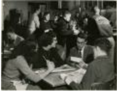
Students at lunch (MS 0061-19-06-012)