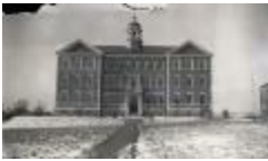
William Smith Hall in the snow (MS_0119-01-083)