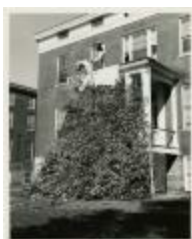
Dorm decorated for Homecoming game (MS 0061-07-15-038)