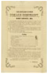
Chestertown Female Seminary advertisement (MS 0091-01-01-001)