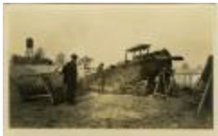
Biplane repairs (MS 0083-01-01-003)