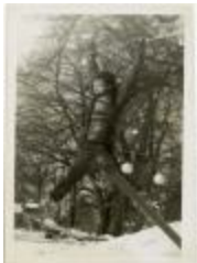
Ski jump (MS_0061-08-14-006)