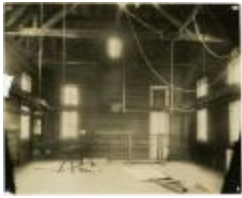
Cain Gym, interior (MS 0061-22-11-024)