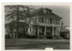
Richmond House (demolished) (MS 0061-25-03-001)