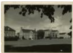
Dunning, Bunting, and William Smith Halls (MS 0061-22-14-036)