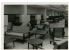
Second floor of Miller Library (MS 0061-24-14-025)