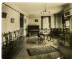
Parlor of Normal Hall (MS 0061-24-19-008)