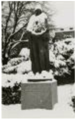
George Washington statue in snow (MS_0061-08-09-033)