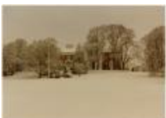
View north from Campus Ave. of South Campus (MS_0061-25-04-051)