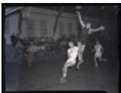
Basketball game (MS 0150-01-24)