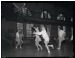
Girls Basketball (MS 0150-01-25)