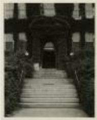
Entrance to William Smith Hall (MS 0061-25-11-053)