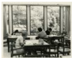
Students in Miller Library (MS 0061-24-14-050)