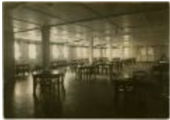
Dining hall in basement of Cain Gym (MS 0061-22-11-026)