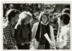
Group of students on campus (MS 0061-20-01-011)