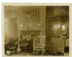
Typical Room in Reid Hall (MS 0061-24-19-012)