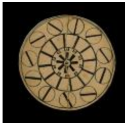
Ludoscope disc (MS 0073-01-01-012)