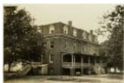
Reid Hall