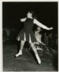
Homecoming bonfire (MS 0061-29-03-005)