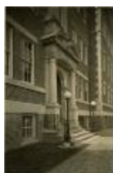
Entrance to William Smith Hall (MS 0061-25-11-026)