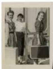
Three students during Freshman Week (MS 0061-06-17-001)