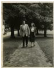
'The Walk' on Washington College Campus (MS 0061-18-21-024)