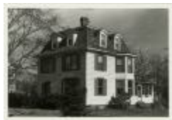
Bell House (MS 0061-25-04-004)