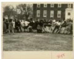
Students play Tug-of-War (MS 0061-10-04-008)