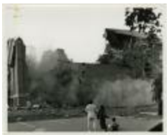
Demolition of Cain Gym (MS 0061-22-12-004)