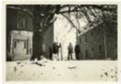
Students outside West Hall in the snow (MS_0061-08-09-030)