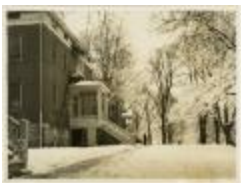
Hill Dorms in the snow (MS_0061-26-16-046)