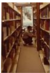
Student in the stacks (MS 0061-24-14-003)