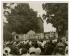
Students on pageant stage (MS 0061-09-07-004)