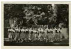
Costumed students dance (MS 0061-09-07-003)