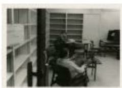
Smoking area (MS 0061-24-14-026)