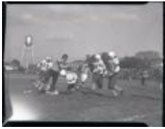
Randolph-Macon vs. Washington College football game (MS 0150-01-27)