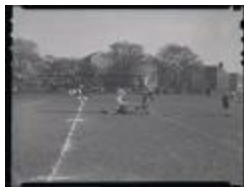
Fraternity stunt during Homecoming football game (MS 0150-01-14)