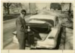
Student with suitcase in front of car (MS 0061-19-07-067)