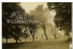
"At Old Washington" (MS 0061-25-11-021)