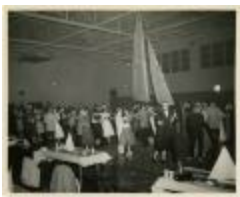
Homecoming dance (MS 0061-07-15-011)