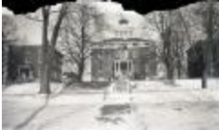
Hill Dorms in the snow (MS_0119-01-073)