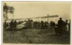
Rear view of biplane (MS 0083-01-01-004)