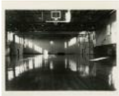
Cain Gym, interior (MS 0061-22-11-025)