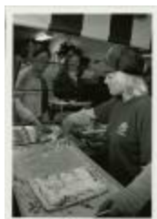
Pizza in the Dining Hall (MS 0061-26-18-009)