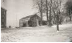
Building in the snow (MS_0119-01-067)