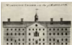
Washington College (MS0059-01-02-001)