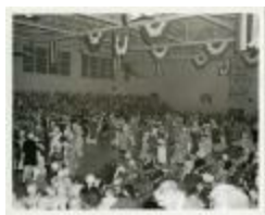
Washington's Birthday Ball (MS 0061-03-01-003)