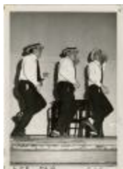
Fraternity brothers at Stunt Night (MS 0061-09-18-012)