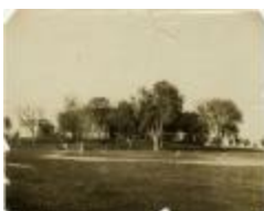
Athletic field prior to 1906 (MS 0061-22-04-002)