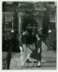
Two students on campus (MS 0061-18-21-025)