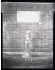
Statue that once stood in front of Dunning Hall. (MS 0150-01-02)