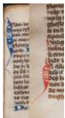
Middle Dutch Psalter figures (MS 0146-01_08)