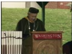
John F. Kennedy, Jr. commencement address (MS 0058-1999-002)