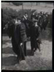
Convocation ceremony (MS 0150-01-12)