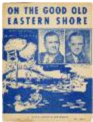
"On the Good Old Eastern Shore" (MS 0094-01-01-010)