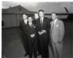
John F. Kennedy (MS 0045-254)