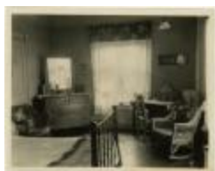
Room in Reid Hall (MS 0061-24-19-010)