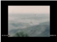
Cross country event (MS 0058-1958-001)