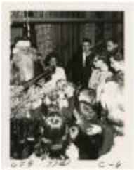
Visit from Santa Claus (MS_0061-08-09-028)