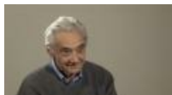
Howard Zinn oral history interview (NHF_BNYDC_2008_Zinn_Howard)