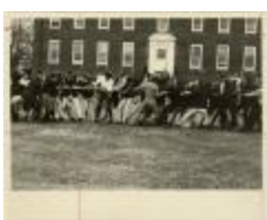
Students playing Tug-of-War (MS 0061-10-04-007)