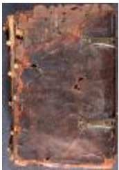
Middle Dutch Psalter (MS 0146-001)