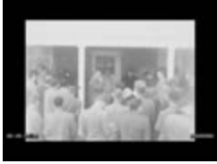
Garrett Foxwell Dormitory dedication and Somerset House cornerstone laying (MS 0058-1949-001)