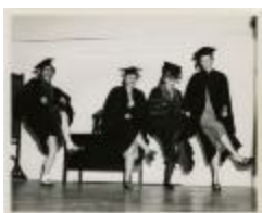
Faculty Stunt Night (MS 0061-09-18-023)