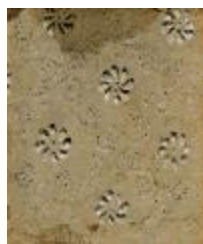
History notebook (MS 0025-01-01-001)