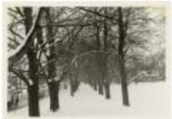
Tree-lined pathway in snow (MS_0061-25-04-048)