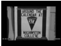
"Around the Calendar" (MS 0058-1932-001)