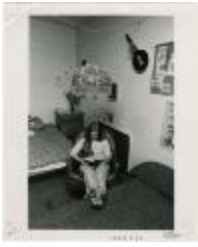
Student reads in her dorm room