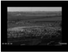
Sesquicentennial and Bicentennial celebrations (MS 0058-1932-002)