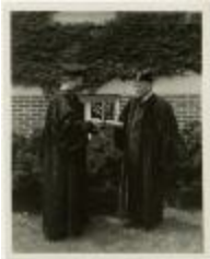
Anna Eleanor Roosevelt with her honorary degree (MS 0061-03-17-003)