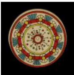
Ludoscope disc (MS 0073-01-01-002)