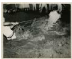
Freshmen-Sophomore Fall Tug-of-War (MS 0061-10-04-002)