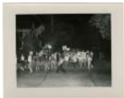
Pep rally for football game against Johns Hopkins (MS 0150-01-16)