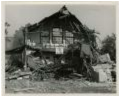
Demolition of Cain Gym (MS 0061-22-12-003)