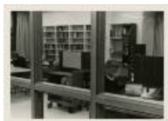
Students in Miller Library (MS 0061-24-14-024)