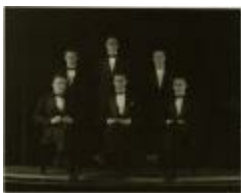
Cotillion Club Committee (MS 0061-11-23-001)