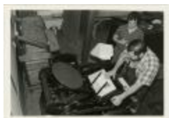
Washington College Literary House Press (MS 0061-25-04-010)