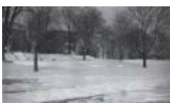
Snow on the campus green (MS 0118-006)