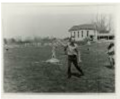
May Day celebration (MS 0061-07-14-002)