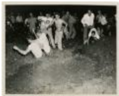
Students playing Tug-of-War (MS 0061-10-04-003)