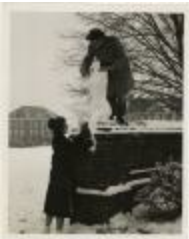
Students building snowman (MS_0061-08-09-029)