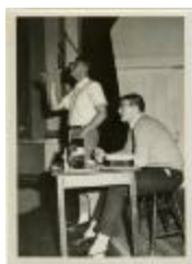
Two students at Senior Auction (MS 0061-09-18-002)