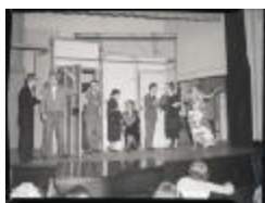
Washington Players production of The Torch-Bearers (MS 0150-01-19)