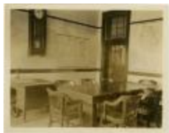
President's Office (MS 0061-24-18-001)