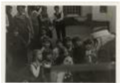
Santa Claus and children (MS_0061-28-09-025)