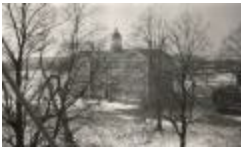
William Smith Hall in the snow (MS_0119-01-082)