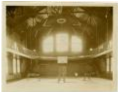
Cain Gym, interior (MS 0061-22-11-023)