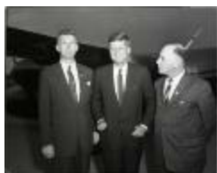
John F. Kennedy (MS 0045-255)