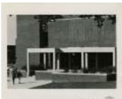
Gibson Fine Art Center (MS 0061-23-18-013)