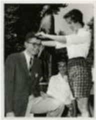
Student crowned with Washington College hat (MS 0061-06-17-008)