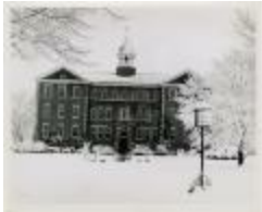
William Smith Hall in the snow (MS_0061-08-09-037)