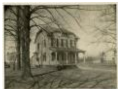
Hodson House/Phi Sigma Phi House (MS 0061-24-03-001)