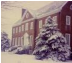
Bunting Hall in snow (MS_0061-22-14-010)