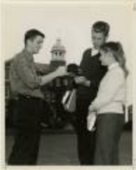
Freshman group in front of B. Smith Hall (MS 0061-06-17-006)