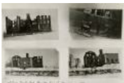
William Smith Hall after the fire of January 1916 (MS 0061-22-13-007)