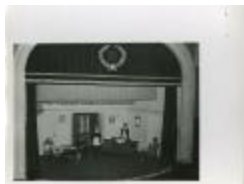
Production of Night Must Fall by Washington Players (MS 0150-01-17)