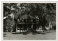
McAlpin House (demolished) (MS 0061-24-13-001)