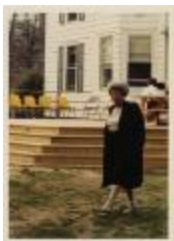
Toni Morrison at the Rose O'Neill Literary House (MS 0061-17-05-008)