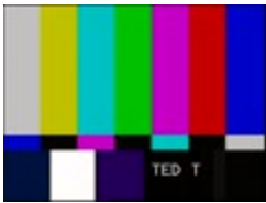
Washington's Birthday Convocation (MS 0058-1999-001)