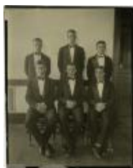
Cotillion Club Committee (MS 0061-11-23-002)