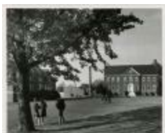
Dunning and Bunting Halls (MS 0061-22-14-049)