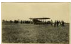
Biplane in a field (MS 0083-01-01-007)