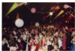
Washington's Birthday Ball (MS 0061-03-01-022)