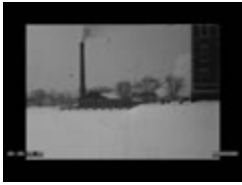
Snow Bound (MS 0058-1933-003)