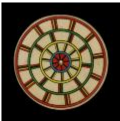
Ludoscope disc (MS 0073-01-01-003)