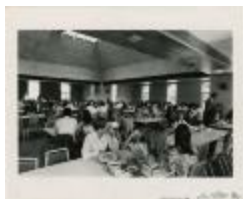
Students in the Dining Hall (MS 0061-26-18-023)