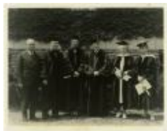
1942 commencement honorees (MS 0061-03-17-004)