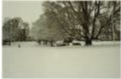
Campus green in the snow (MS_0061-25-04-024)