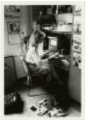
Student in her dorm room (MS 0061-19-04-001)