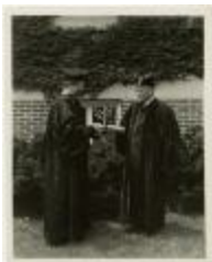
Anna Eleanor Roosevelt with her honorary degree (MS 0061-03-17-003)