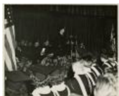
Eleanor Roosevelt giving the commencement address (MS 0061-03-17-008)