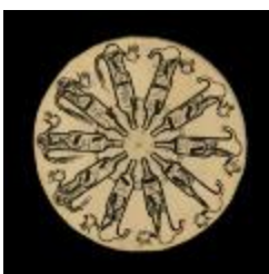
Lidoscope disc (MS 0073-01-01-011)