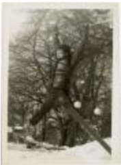
Ski jump (MS_0061-08-14-006)