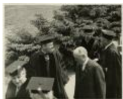
1942 commencement (MS 0061-03-17-005)