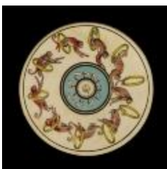
Lidoscope disc (MS 0073-01-01-008)