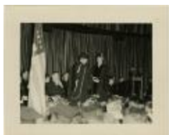
Anna Eleanor Roosevelt receiving her honorary doctorate of law (MS 0061-03-17-010)