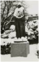
George Washington statue in snow (MS_0061-08-09-033)