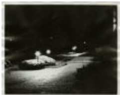
Night snow (MS_0061-22-14-060)