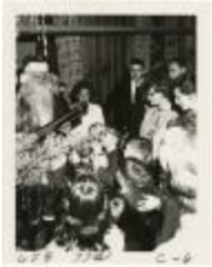
Visit from Santa Claus (MS_0061-08-09-028)