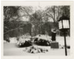
View of Hill Dorms and Washington statue in the snow (MS_0061-25-04-047)