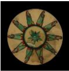
Ludoscope disc (MS 0073-01-01-014)