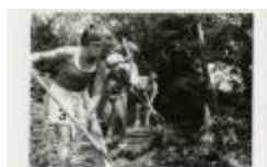
Students during Casey Time (MS 0061-03-03-021)