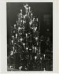
Christmas tree (MS_0061-08-09-035)