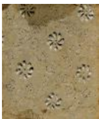
History notebook (MS 0025-01-01-001)