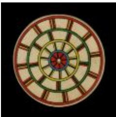
Ludoscope disc (MS 0073-01-01-003)