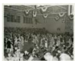
Washington's Birthday Ball (MS 0061-03-01-003)