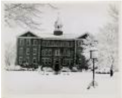
William Smith Hall in the snow (MS_0061-08-09-037)