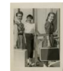
Three students during Freshman Week (MS 0061-06-17-001)