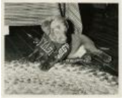
The College Mascot (MS 0061-29-04-002)