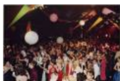
Washington's Birthday Ball (MS 0061-03-01-022)