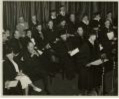
Eleanor Roosevelt giving the commencement address (MS 0061-03-17-011)