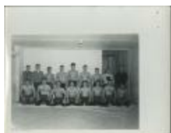
Wrestling Team (MS 0150-01-29)