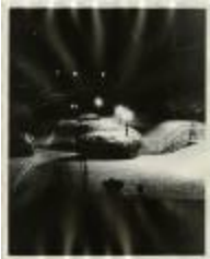
Cater Walk at night (MS_0061-22-14-061)