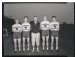
Relay Team (MS 0150-01-28)