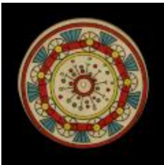
Ludoscope disc (MS 0073-01-01-002)