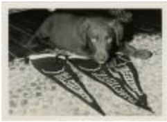
The College Mascot (MS 0061-29-04-001)