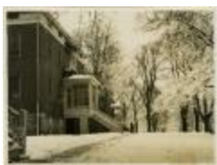
Hill Dorms in the snow (MS_0061-23-21-038)