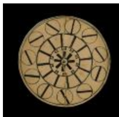
Ludoscope disc (MS 0073-01-01-012)