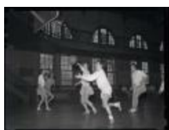
Girls Basketball (MS 0150-01-25)