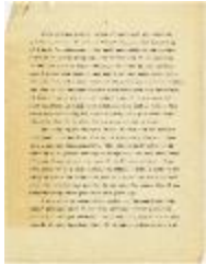
Typescript of Eleanor Roosevelt's commencement address (MS 0059-13-13-006)