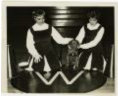
The College Mascot (MS 0061-29-04-003)