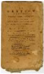
"An Oration in Memory of General Montgomery" by William Smith (WAC-003-001-01-13-001)