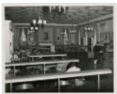
George A. Bunting Library (MS 0061-24-11-012)