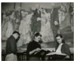
Students reading in Bunting Library (MS 0061-24-11-010)