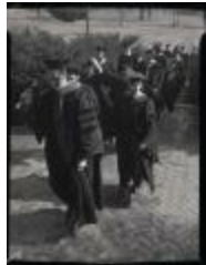
Convocation ceremony (MS 0150-01-12)