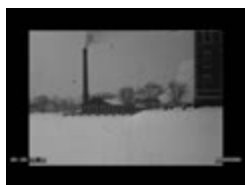
Snow Bound (MS 0058-1933-003)