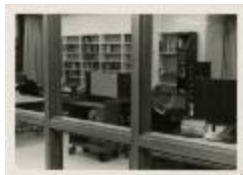
Students in Miller Library