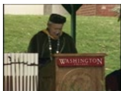
John F. Kennedy, Jr. commencement address (MS 0058-1999-002)