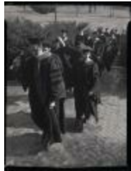
Convocation ceremony (MS 0150-01-12)