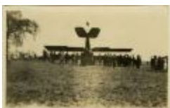
Biplane, rear view (MS 0083-01-01-006)