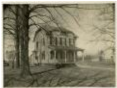
Hodson House/Phi Sigma Phi House (MS 0061-24-03-001)