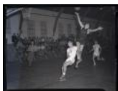
Basketball game (MS 0150-01-24)