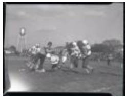
Randolph-Macon vs. Washington College football game (MS 0150-01-27)