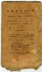
"An Oration in Memory of General Montgomery" by William Smith (WAC-003-001-01-13-001)