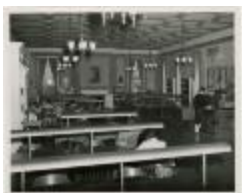
George A. Bunting Library (MS 0061-24-11-012)