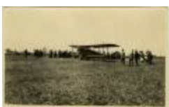
Biplane in a field (MS 0083-01-01-007)