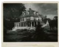
Rose O'Neill Literary House (MS 0061-25-04-012)