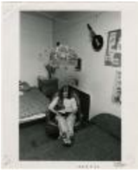
Student reads in her dorm room (MS 0061-19-04-007)