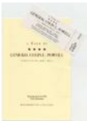
Program and ticket for Colin Powell speech (MS 0059-65-16-Ticket and program)