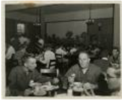
Students in Hodson Hall (MS 0061-26-18-007)