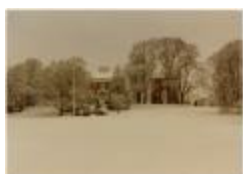
View north from Campus Ave. of South Campus (MS_0061-25-04-051)