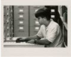
Student at microfilm collection (MS 0061-20-04-032)