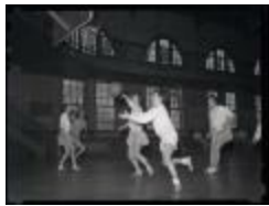
Girls Basketball (MS 0150-01-25)