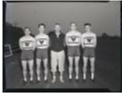
Relay Team (MS 0150-01-28)