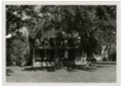
McAlpin House (demolished) (MS 0061-24-13-001)