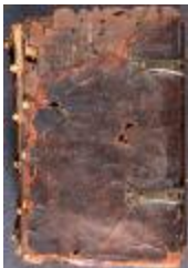
Middle Dutch Psalter (MS 0146-001)