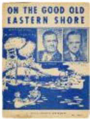
"On the Good Old Eastern Shore" (MS 0094-01-01-010)