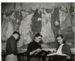
Students reading in Bunting Library (MS 0061-24-11-010)