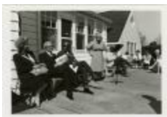
Toni Morrison and Rev. Benjamin Hooks at the Rose O'Neill Literary House (MS 0061-17-05-004)