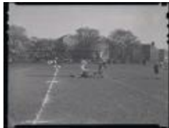
Fraternity stunt during Homecoming football game (MS 0150-01-14)