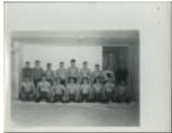
Wrestling Team (MS 0150-01-29)