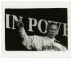
Colin Powell speaking (MS 0061-17-19-006)