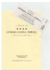
Program and ticket for Colin Powell speech (MS 0059-65-16-Ticket and program)