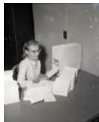
Woman with 175th Anniversary programs (MS_0045-232)