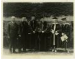
1942 commencement honorees (MS 0061-03-17-004)