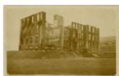
Ruin of William Smith Hall after the fire in 1916. (MS 0061-22-13-001)