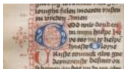
Middle Dutch Psalter illuminated Capital (MS 0146-01_01)