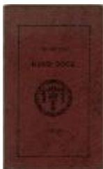
Washington College Freshman Hand Book, 1924-1925 (Freshman_Handbook_1924-1925)