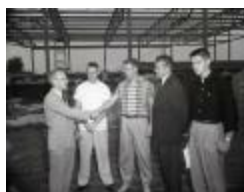
Group of men in front of gym construction (MS_0045-251)