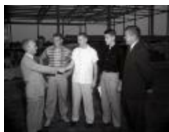
Close-up of men in front of gym construction project (MS_0045-252)