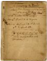
Two sermons on Overcoming the World (WAC-003-001-01-20-001)