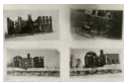
William Smith Hall after the fire of January 1916 (MS 0061-22-13-007)