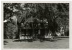
McAlpin House (demolished) (MS 0061-24-13-001)