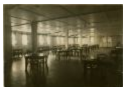
Dining hall in basement of Cain Gym (MS 0061-22-11-026)