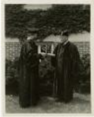
Anna Eleanor Roosevelt with her honorary degree (MS 0061-03-17-003)