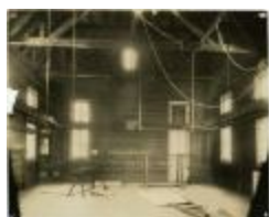
Cain Gym, interior (MS 0061-22-11-024)