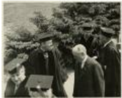
1942 commencement (MS 0061-03-17-005)