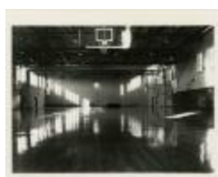
Cain Gym, interior (MS 0061-22-11-025)