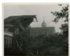
Demolition of Cain Gym (MS 0061-22-12-001)