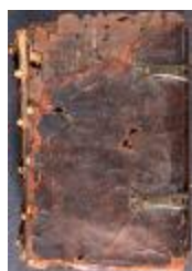
Middle Dutch Psalter (MS 0146-001)