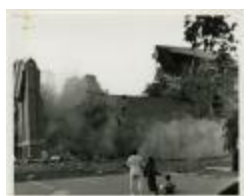
Demolition of Cain Gym (MS 0061-22-12-004)