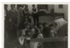
Santa Claus and children (MS_0061-28-09-025)