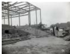
Gym construction and onlookers (MS_0045-250)