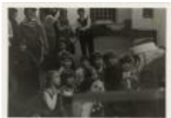
Santa Claus and children (MS_0061-28-09-025)