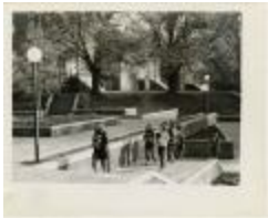
Miller Library Move (MS 0061-09-03-001)