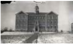
William Smith Hall in the snow (MS_0119-01-083)