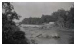
Unidentified location (MS 0118-009)