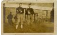
Two football players (MS 0084-01-01-003)