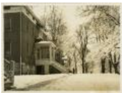
Hill Dorms in the snow (MS_0061-26-16-046)