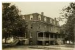
Reid Hall (MS 0061-24-19-003)