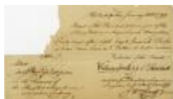
Schuylkill and Susquehanna Navigation Company receipt (WAC-003-001-01-19-002)