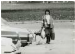
Student moving out (MS 0061-19-08-004)