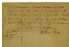
Schuylkill and Susquehanna Navigation Company note (WAC-003-001-01-19-001)