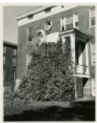
Dorm decorated for Homecoming game (MS 0061-07-15-038)