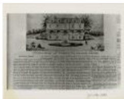
News Article on "Normal Hall" (MS 0061-24-19-007)