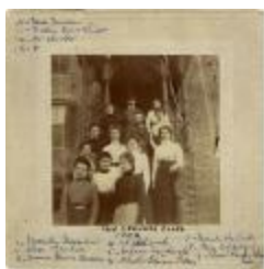
Co-Eds of Washington College (MS 0061-18-17-004)