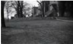
Hill Dorms (MS 0118-002)