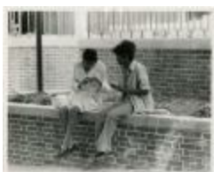
Students on Campus (MS 0061-19-08-042)