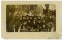
Washington College football team (MS 0084-01-01-001)