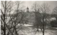
William Smith Hall in the snow (MS_0119-01-082)