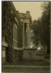
Entrance to Cain Gym (MS 0061-22-11-011)