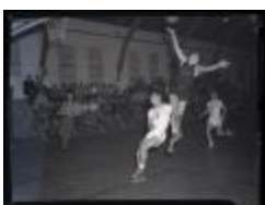
Basketball game (MS 0150-01-24)