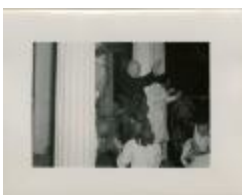
College Pep Rally (MS 0150-01-10)