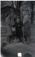
Three students (MS 0118-051)