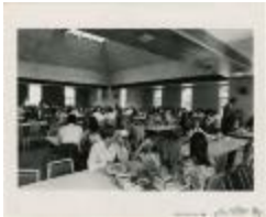
Students in the Dining Hall (MS 0061-26-18-023)