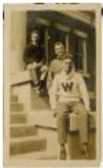
Three students on steps (MS 0084-01-01-004)