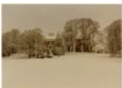
View north from Campus Ave. of South Campus (MS_0061-25-04-051)