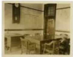
President's Office (MS 0061-24-18-001)