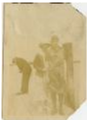
On the dock (MS 0084-01-01-008)