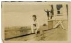
Student sitting on roof (MS 0084-01-01-005)