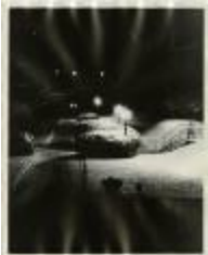
Cater Walk at night (MS_0061-22-14-061)