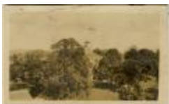
Middle Hall (MS 0084-01-01-006)