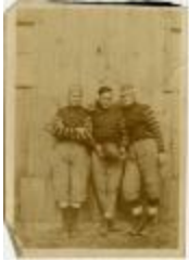
Three football players (MS 0084-01-01-002)