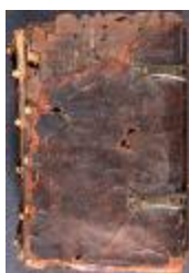
Middle Dutch Psalter (MS 0146-001)