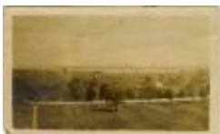
Campus landscape (MS 0084-01-01-007)