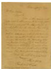
Rembrandt Peale letter, forgery (MS 0116-01-01-001)