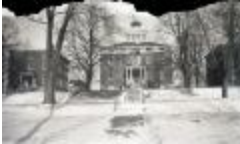
Hill Dorms in the snow (MS_0119-01-073)