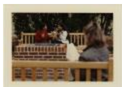
Students on Cater Walk (MS 0061-20-02-064)