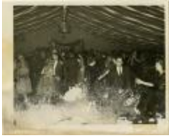
Students at Homecoming dance (MS 0061-07-15-016)