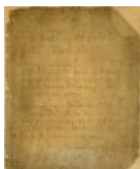
Dedication of Washington College (WAC-003-001-01-06-001)