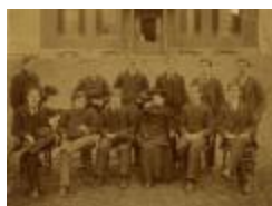
Class of 1895 (MS 0061_OS_class of 1895)