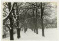
Tree-lined pathway in snow (MS_0061-25-04-048)