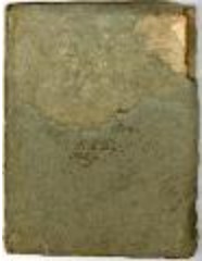
September Term 1822 (MS 0011-1822-09-001)