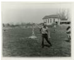
May Day celebration (MS 0061-07-14-002)