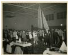
Homecoming dance (MS 0061-07-15-011)