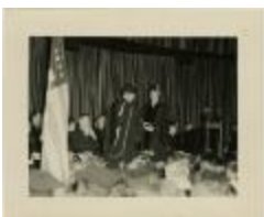
Anna Eleanor Roosevelt receiving her honorary doctorate of law (MS 0061-03-17-010)