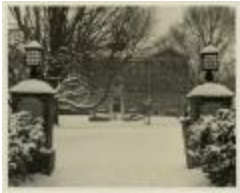
William Smith Hall in the snow (MS_0061-25-11-069)