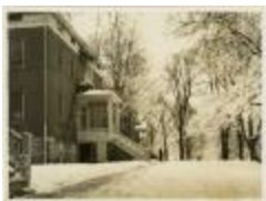
Hill Dorms in the snow (MS_0061-26-16-046)