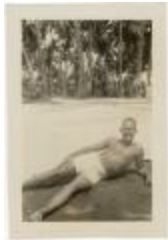
Lt. Louis L. Goldstein (MS 0163-01-01-003)