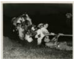
Students playing Tug-of-War (MS 0061-10-04-001)