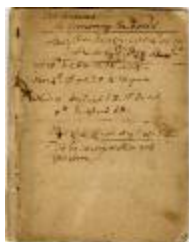
Two sermons on Overcoming the World (WAC-003-001-01-20-001)