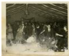
Students at Homecoming dance (MS 0061-07-15-016)