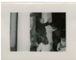
College Pep Rally (MS 0150-01-10)