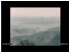
Cross country event (MS 0058-1958-001)