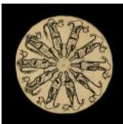
Lidoscope disc (MS 0073-01-01-011)