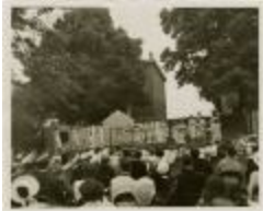
Students on pageant stage (MS 0061-09-07-004)