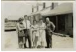
Group photo (MS 0084-01-01-0010)