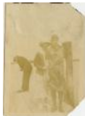
On the dock (MS 0084-01-01-008)