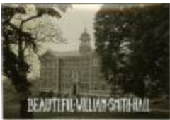
"Beautiful William Smith Hall" (MS 0061-25-11-019)