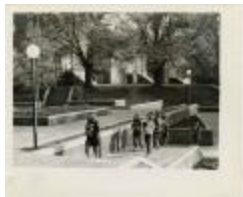
Miller Library Move (MS 0061-09-03-001)