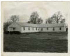
G.I. dorms (demolished)