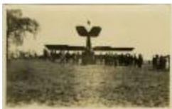
Biplane, rear view (MS 0083-01-01-006)