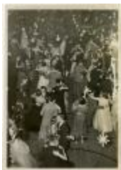
Students dancing at Homecoming (MS 0061-07-15-043)