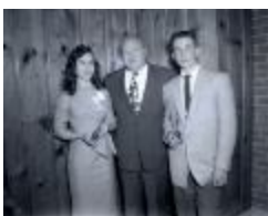
Awards ceremony (MS_0045-160)