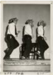
Fraternity brothers at Stunt Night (MS 0061-09-18-012)