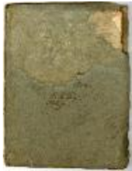
September Term 1822 (MS 0011-1822-09-001)