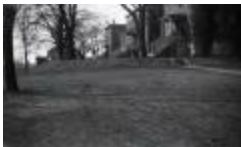
Hill Dorms (MS 0118-002)