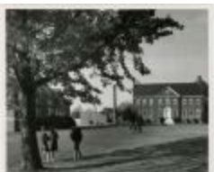
Dunning and Bunting Halls (MS 0061-22-14-049)