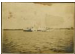
Boat coming in to harbor (MS 0089-01-01-007)