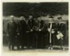
1942 commencement honorees (MS 0061-03-17-004)