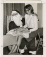
Santa and student (MS_0061-08-09-026)