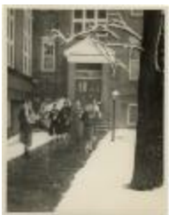
Students leaving William Smith Hall during snow (MS_0061-08-09-036)