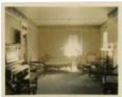
Social Room in Reid Hall (MS 0061-24-19-011)