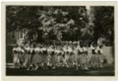
Costumed students dance (MS 0061-09-07-003)