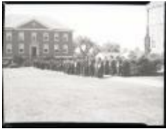
Graduation exercises (MS 0150-01-11)