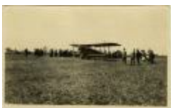
Biplane in a field (MS 0083-01-01-007)