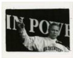
Colin Powell speaking (MS 0061-17-19-006)