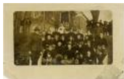
Washington College football team (MS 0084-01-01-001)