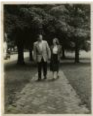
'The Walk' on Washington College Campus