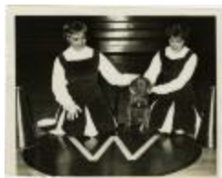
The College Mascot (MS 0061-29-04-003)