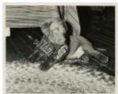
The College Mascot (MS 0061-29-04-002)