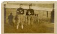
Two football players (MS 0084-01-01-003)