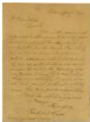
Rembrandt Peale letter, forgery (MS 0116-01-01-001)