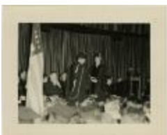
Anna Eleanor Roosevelt receiving her honorary doctorate of law (MS 0061-03-17-010)