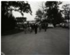
Walking to the College (MS 0045-258)