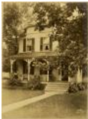
Vice Principal's House (MS 0061-23-13-005)