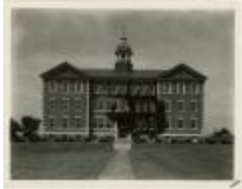
William Smith Hall (MS 0061-25-11-060)