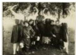
National Dance Pageant (MS 0061-09-07-001)