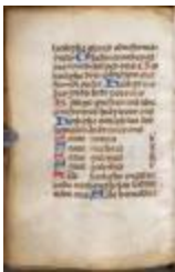
Middle Dutch Psalter litany of Saints (MS 0146-01_04)