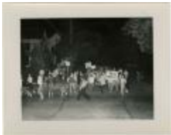
Pep rally for football game against Johns Hopkins (MS 0150-01-16)