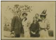
Group photograph (MS 0089-01-01-006)