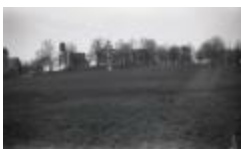
Hill Dorms and the campus green (MS 0118-004)