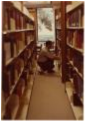
Student in the stacks (MS 0061-24-14-003)