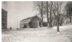
Building in the snow (MS_0119-01-067)