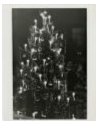
Christmas tree (MS_0061-08-09-035)