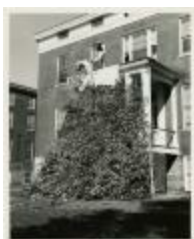
Dorm decorated for Homecoming game (MS 0061-07-15-038)