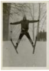
Student skiing in front of crowd (MS_0061-08-14-012)