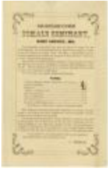
Chestertown Female Seminary advertisement (MS 0091-01-01-001)