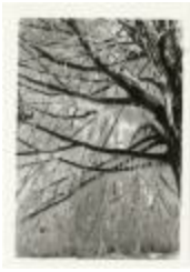
Icicles on a tree (MS_0061-25-04-012)