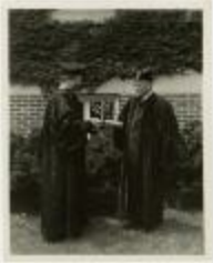
Anna Eleanor Roosevelt with her honorary degree (MS 0061-03-17-003)