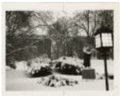
View of Hill Dorms and Washington statue in the snow (MS_0061-25-04-047)