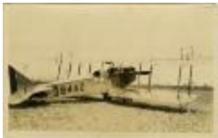
Biplane 38442 on campus (MS 0083-01-01-001)