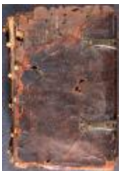
Middle Dutch Psalter (MS 0146-001)