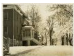
Hill Dorms in the snow (MS_0061-26-16-046)