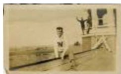
Student sitting on roof (MS 0084-01-01-005)