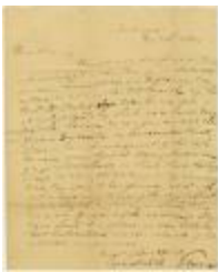
John Emory letter (MS 0019-01-01-001)