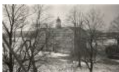
William Smith Hall in the snow (MS_0119-01-082)