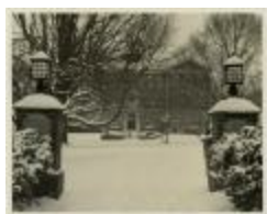
William Smith Hall in the snow (MS_0061-25-11-069)