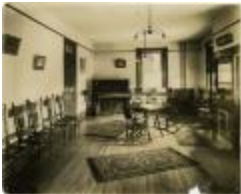
Parlor of Normal Hall (MS 0061-24-19-008)