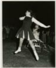
Homecoming bonfire (MS 0061-29-03-005)