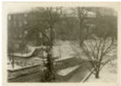
View of Hill Dorms in the snow (MS_0061-26-16-015)