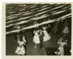
Aerial view of Homecoming dance (MS 0061-07-15-015)