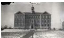
William Smith Hall in the snow (MS_0119-01-083)