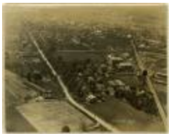
Aerial view of Washington College campus (MS 0061-22-02-006)