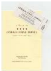
Program and ticket for Colin Powell speech (MS 0059-65-16-Ticket and program)