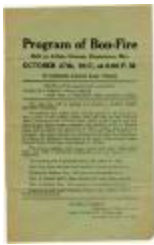
Program of Bon-Fire (MS 0173-01-001)