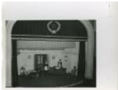
Production of Night Must Fall by Washington Players (MS 0150-01-17)