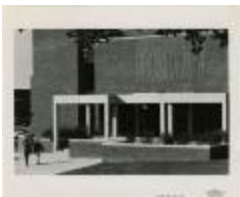
Gibson Fine Art Center (MS 0061-23-18-013)