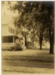
Faculty Row (MS 0061-23-13-004)