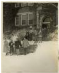
Students leaving William Smith Hall (MS_0061-21-10-012)