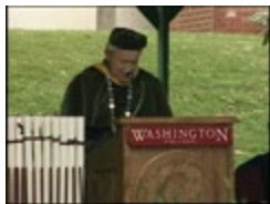
John F. Kennedy, Jr. commencement address (MS 0058-1999-002)