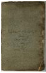
Ezekiel F. Chambers Esq. Docket May Term 1822 (MS 0011-1822-05-001)