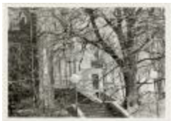
Hill Dorms during snow (MS_0061-26-16-031)