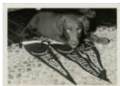
The College Mascot (MS 0061-29-04-001)