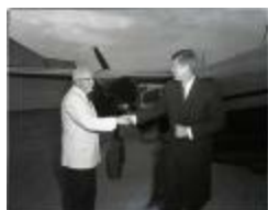
John F. Kennedy, arrives in Chestertown (MS 0045-253)