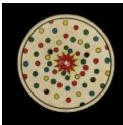
Lidoscope disc (MS 0073-01-01-007)