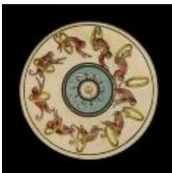
Lidoscope disc (MS 0073-01-01-008)