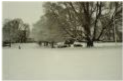
Campus green in the snow (MS_0061-25-04-024)