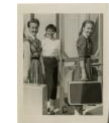
Three students during Freshman Week (MS 0061-06-17-001)