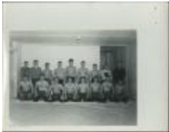
Wrestling Team (MS 0150-01-29)