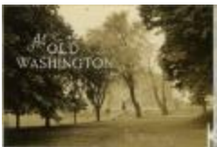
"At Old Washington" (MS 0061-25-11-021)