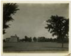
College lawn, circa 1920 (MS 0061-22-14-057)