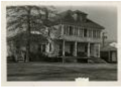
Richmond House (demolished) (MS 0061-25-03-001)