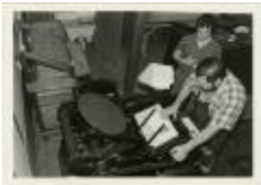
Washington College Literary House Press (MS 0061-25-04-010)