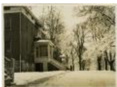
Hill Dorms in the snow (MS_0061-23-21-038)