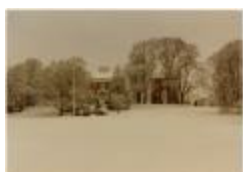
View north from Campus Ave. of South Campus (MS_0061-25-04-051)