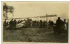
Rear view of biplane (MS 0083-01-01-004)