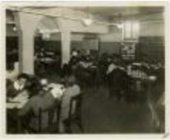
Library in the basement of William Smith Hall (MS 0061-25-12-002)