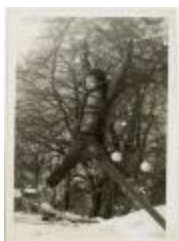
Ski jump (MS_0061-08-14-006)