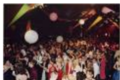
Washington's Birthday Ball (MS 0061-03-01-022)