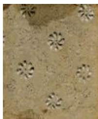
History notebook (MS 0025-01-01-001)