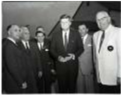
John F. Kennedy and supporters (MS 0045-256)