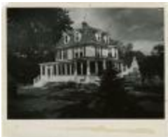
Rose O'Neill Literary House (MS 0061-25-04-012)