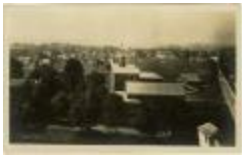
Aerial view of campus (MS 0083-01-01-010)