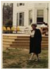
Toni Morrison at the Rose O'Neill Literary House (MS 0061-17-05-008)