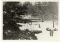
A couple in the snow (MS_0061-25-04-058)