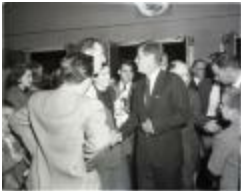
Kennedy shaking hands (MS 0045-265)