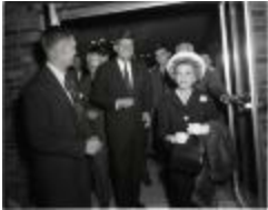
Kennedy leaving his speech at Washington College. (MS 0045-264)