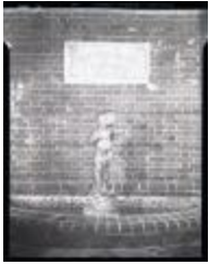
Statue that once stood in front of Dunning Hall. (MS 0150-01-02)