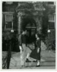
Two students on campus (MS 0061-18-21-025)