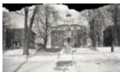
Hill Dorms in the snow (MS_0119-01-073)