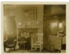
Typical Room in Reid Hall (MS 0061-24-19-012)