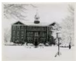
William Smith Hall in the snow (MS_0061-08-09-037)