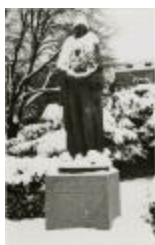
George Washington statue in snow (MS_0061-08-09-033)