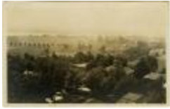
Aerial view of campus (MS 0083-01-01-009)