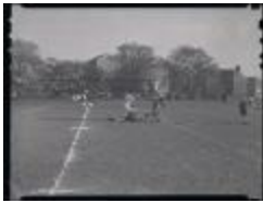
Fraternity stunt during Homecoming football game (MS 0150-01-14)