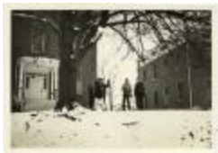
Students outside West Hall in the snow (MS_0061-08-09-030)