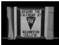
"Around the Calendar" (MS 0058-1932-001)