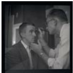
The Washington Players (MS 150-01-08)