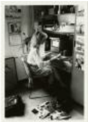
Student in her dorm room (MS 0061-19-04-001)