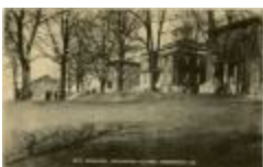
"Boys' Dormitory" (MS 0061-23-21-004)