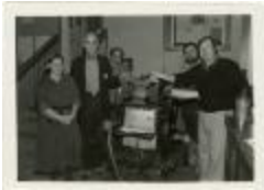
Washington College Literary House Press (MS 0061-25-04-005)