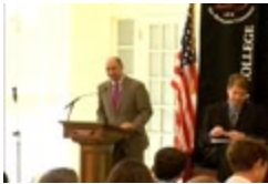
The Senatorial Colloquy on American History and Politics at Washington College, Session 02 (MS 0058_2007-2008_Senate_02)