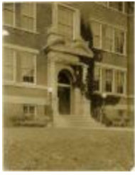
William Smith Hall (MS 0061-25-11-047)