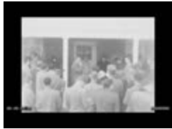
Garrett Foxwell Dormitory dedication and Somerset House cornerstone laying (MS 0058-1949-001)