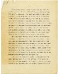
Typewritten of Eleanor Roosevelt's commencement address (MS 0059-13-13-006)