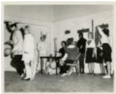
"Alice in Wonderland" at Stunt Night (MS 0061-09-18-018)