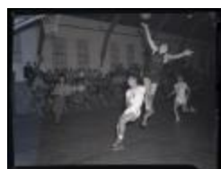
Basketball game (MS 0150-01-24)