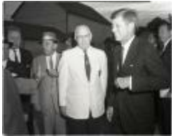
John F. Kennedy arriving in Chestertown (MS 0045-257)