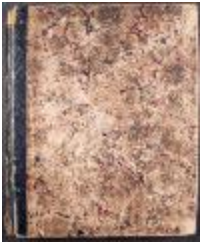
Commonplace book (WAC-003-001-07-10-001)