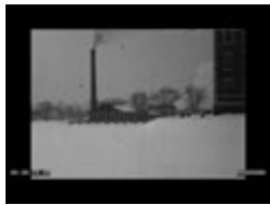
Snow Bound (MS 0058-1933-003)