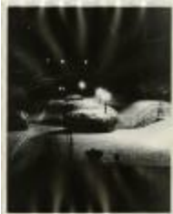
Cater Walk at night (MS_0061-22-14-061)