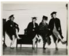
Faculty Stunt Night (MS 0061-09-18-023)