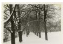
Tree-lined pathway in snow (MS_0061-25-04-048)