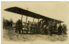
Biplane and crowd (MS 0083-01-01-005)