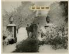
Students walking through snow (MS_0061-19-07-102)