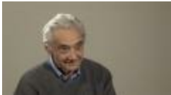
Howard Zinn oral history interview (NHF_BNYDC_2008_Zinn_Howard)