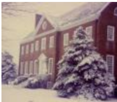
Bunting Hall in snow (MS_0061-22-14-010)