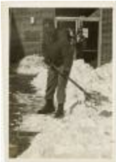
Man shoveling snow (MS_0061-25-04-102)