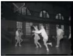
Girls Basketball (MS 0150-01-25)