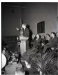
Kennedy speaking at Washington College (MS 0045-261)