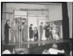
Washington Players production of The Torch-Bearers (MS 0150-01-19)