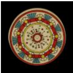
Ludoscope disc (MS 0073-01-01-002)