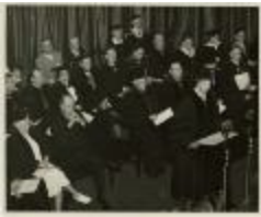
Eleanor Roosevelt giving the commencement address (MS 0061-03-17-011)