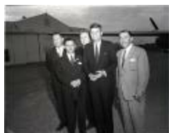
John F. Kennedy (MS 0045-254)