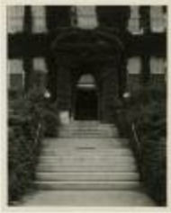
Entrance to William Smith Hall (MS 0061-25-11-053)