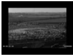
Sesquicentennial and Bicentennial celebrations (MS 0058-1932-002)