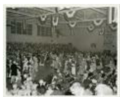
Washington's Birthday Ball (MS 0061-03-01-003)