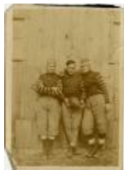
Three football players (MS 0084-01-01-002)