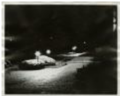
Night snow (MS_0061-22-14-060)