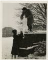
Students building snowman (MS_0061-08-09-029)