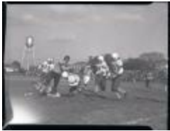
Randolph-Macon vs. Washington College football game (MS 0150-01-27)