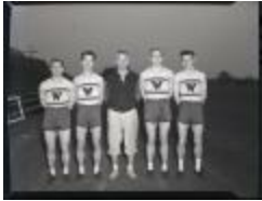
Relay Team (MS 0150-01-28)