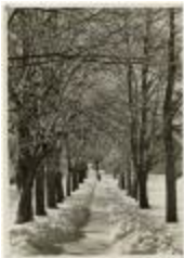
"The Walk" in the snow (MS_0061-25-04-060)