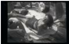
Washington College students at the Chester River Yacht and Country Club (MS 0150-01-20)