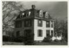
Bell House (MS 0061-25-04-004)