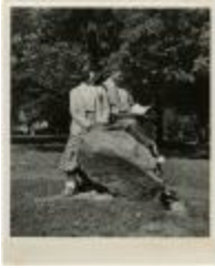
Students at "the Rock" (MS 0061-18-21-026)