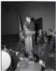
Kennedy speaking at Washington College (MS 0045-260)