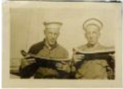
Two men in "dixie cup" hats eating watermelon (MS 0084-01-01-009)