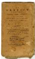
"An Oration in Memory of General Montgomery" by William Smith (WAC-003-001-01-13-001)