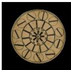
Ludoscope disc (MS 0073-01-01-012)