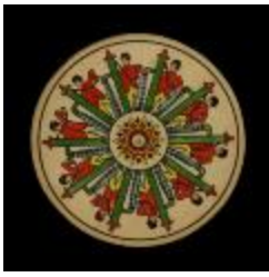
Lidoscope disc (MS 0073-01-01-004)