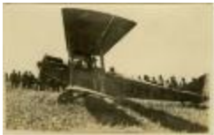
Biplane 38442, side view (MS 0083-01-01-002)