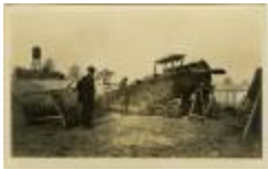
Biplane repairs (MS 0083-01-01-003)