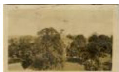
Middle Hall (MS 0084-01-01-006)