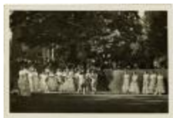
Costumed students dance at pageant (MS 0061-09-07-002)