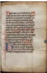
Middle Dutch Psalter, edits (MS 0146-01_06)