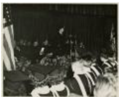
Eleanor Roosevelt giving the commencement address (MS 0061-03-17-008)