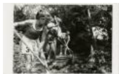
Students during Casey Time (MS 0061-03-03-021)