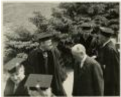
1942 commencement (MS 0061-03-17-005)