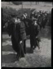
Convocation ceremony (MS 0150-01-12)