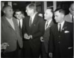
John F. Kennedy at Washington College (MS 0045-266)