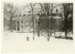
Reid Hall in the snow (MS_0061-25-04-054)