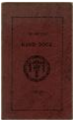
Washington College Freshman Hand Book, 1924-1925 (Freshman_Handbook_1924-1925)