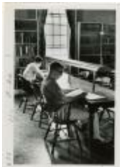
Students studying in Bunting Library (MS 0061-24-11-006)