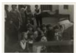
Santa Claus and children (MS_0061-28-09-025)