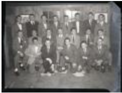
Kappa Alpha banquet (MS 0150-01-04)