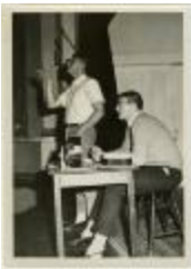
Two students at Senior Auction (MS 0061-09-18-002)