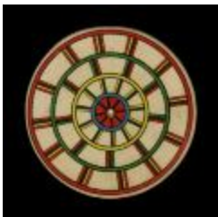
Ludoscope disc (MS 0073-01-01-003)