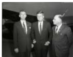
John F. Kennedy (MS 0045-255)