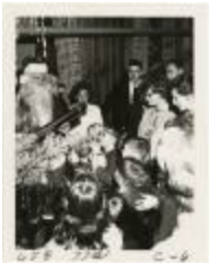
Visit from Santa Claus (MS_0061-08-09-028)