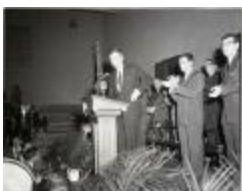
Kennedy speaking at Washington College (MS 0045-262)