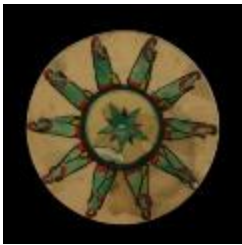
Ludoscope disc (MS 0073-01-01-014)