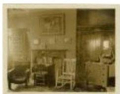
Typical Room in Reid Hall (MS 0061-24-19-012)