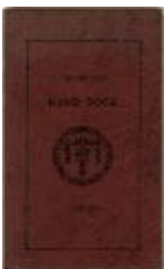
Washington College Freshman Hand Book, 1924-1925 (Freshman_Handbook_1924-1925)