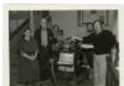
Washington College Literary House Press (MS 0061-25-04-005)