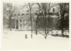
Reid Hall in the snow (MS_0061-25-04-054)