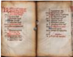
Middle Dutch Psalter November calendar (MS 0146-01_03)