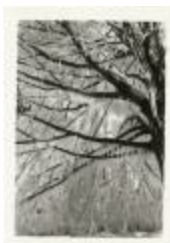
Icicles on a tree (MS_0061-25-04-012)