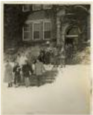
Students leaving William Smith Hall (MS_0061-21-10-012)