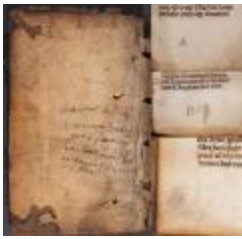
Middle Dutch Psalter flyleaves (MS 0146-01_10)