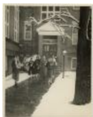
Students leaving William Smith Hall during snow (MS_0061-08-09-036)