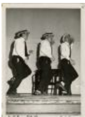
Fraternity brothers at Stunt Night (MS 0061-09-18-012)