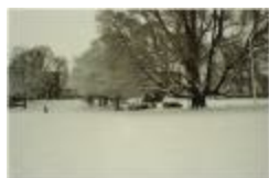
Campus green in the snow (MS_0061-25-04-024)