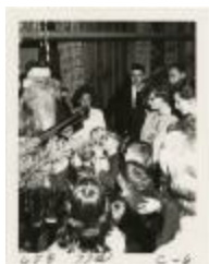
Visit from Santa Claus (MS_0061-08-09-028)