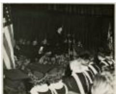
Eleanor Roosevelt giving the commencement address (MS 0061-03-17-008)