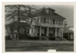
Richmond House (demolished) (MS 0061-25-03-001)