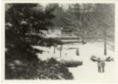
A couple in the snow (MS_0061-25-04-058)