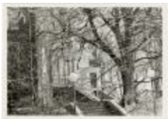
Hill Dorms during snow (MS_0061-26-16-031)