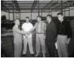
Group of men in front of gym construction (MS_0045-251)