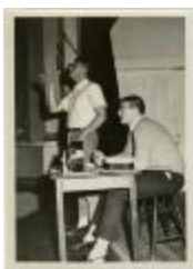
Two students at Senior Auction (MS 0061-09-18-002)