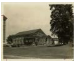
Cain Gym (MS 0061-22-11-018)