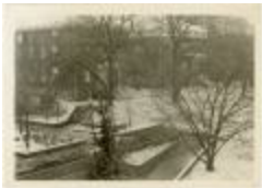
View of Hill Dorms in the snow (MS_0061-26-16-015)