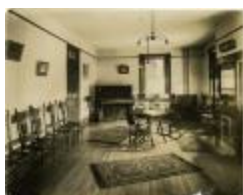
Parlor of Normal Hall (MS 0061-24-19-008)