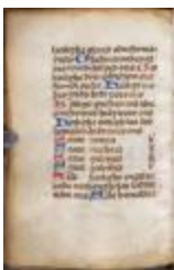
Middle Dutch Psalter litany of Saints (MS 0146-01_04)