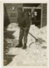
Man shoveling snow (MS_0061-25-04-102)