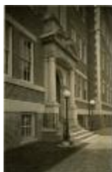
Entrance to William Smith Hall (MS 0061-25-11-026)