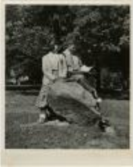
Students at "the Rock" (MS 0061-18-21-026)