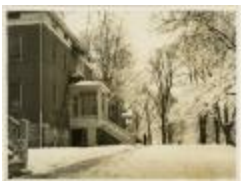
Hill Dorms in the snow (MS_0061-26-16-046)