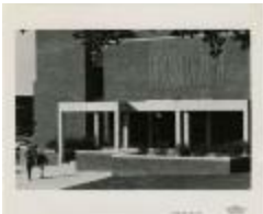
Gibson Fine Art Center (MS 0061-23-18-013)