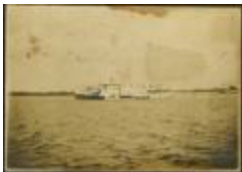
Boat coming in to harbor (MS 0089-01-01-007)