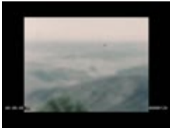
Cross country event (MS 0058-1958-001)