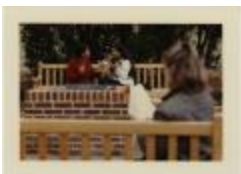
Students on Cater Walk (MS 0061-20-02-064)