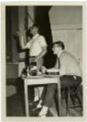
Two students at Senior Auction (MS 0061-09-18-002)