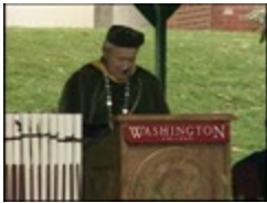
John F. Kennedy, Jr. commencement address (MS 0058-1999-002)