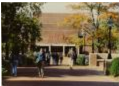
Gibson Fine Arts Center (MS 0061-23-18-008)