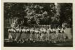
Costumed students dance (MS 0061-09-07-003)