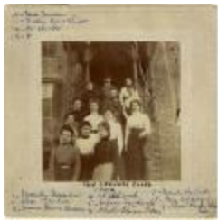
Co-Eds of Washington College (MS 0061-18-17-004)