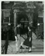
Two students on campus (MS 0061-18-21-025)