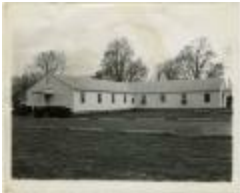
G.I. dorms (demolished) (MS 0061-23-16-007)