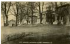
"Boys' Dormitory" (MS 0061-23-21-004)