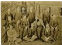
Class of 1895 (MS 0061-18-17-003)