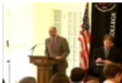
The Senatorial Colloquy on American History and Politics at Washington College, Session 02 (MS 0058_2007-2008_Senate_02)