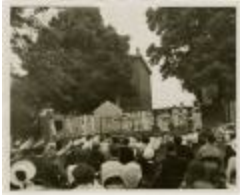
Students on pageant stage (MS 0061-09-07-004)