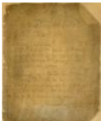
Dedication of Washington College (WAC-003-001-01-06-001)