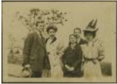
Group photograph (MS 0089-01-01-006)