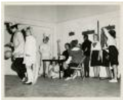
"Alice in Wonderland" at Stunt Night (MS 0061-09-18-018)