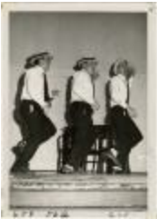
Fraternity brothers at Stunt Night (MS 0061-09-18-012)