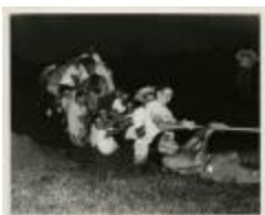
Students playing Tug-of-War (MS 0061-10-04-001)