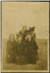
Washington College Normal department students and their friends