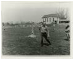
May Day celebration (MS 0061-07-14-002)