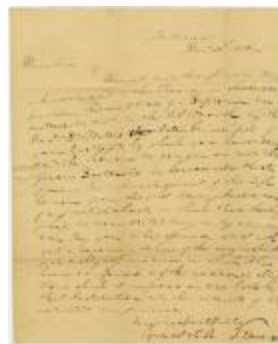
John Emory letter (MS 0019-01-01-001)