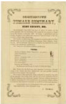
Chestertown Female Seminary advertisement (MS 0091-01-01-001)