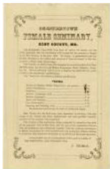
Chestertown Female Seminary advertisement (MS 0091-01-01-001)