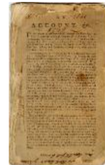
"An Account of Washington College in the State of Maryland" (WAC-003-001-01-01-001)