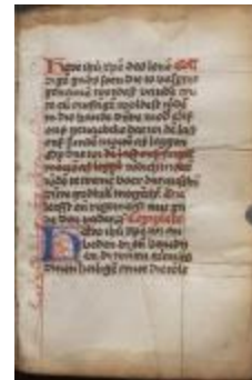
Middle Dutch Psalter, edits (MS 0146-01_06)