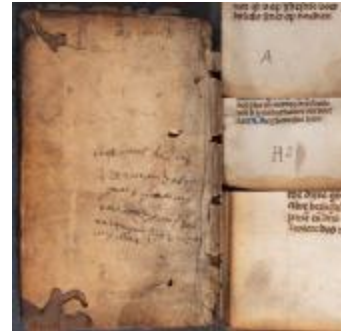
Middle Dutch Psalter flyleafs (MS 0146-01_10)