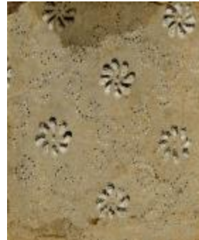
History notebook (MS 0025-01-01-001)