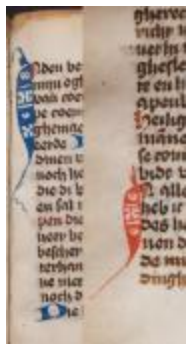
Middle Dutch Psalter figures (MS 0146-01_08)