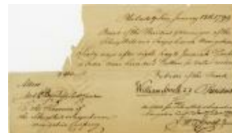
Schuylkill and Susquehanna Navigation Company receipt (WAC-003-001-01-19-002)