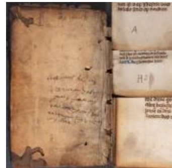
Middle Dutch Psalter flyleaves (MS 0146-01_10)