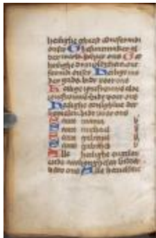
Middle Dutch Psalter litany of Saints (MS 0146-01_04)