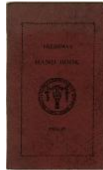
Washington College Freshman Hand Book, 1924-1925 (Freshman_Handbook_1924-1925)