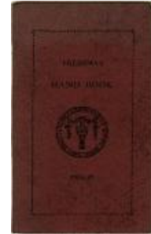
Washington College Freshman Hand Book, 1924-1925 (Freshman_Handbook_1924-1925)