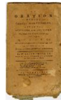
"An Oration in Memory of General Montgomery" by William Smith (WAC-003-001-01-13-001)