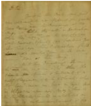
William Paca letter (MS 0039-01-01-001)