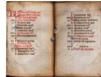
Middle Dutch Psalter November calendar (MS 0146-01_03)