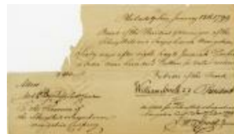
Schuylkill and Susquehanna Navigation Company receipt (WAC-003-001-01-19-002)