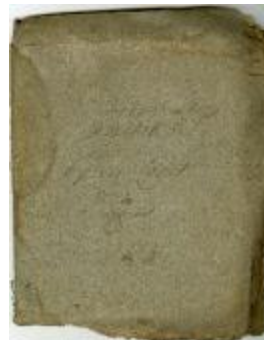
Ezekiel F. Chambers Esq. Docket to April Court 1821 (MS 0011-1821-04-001)