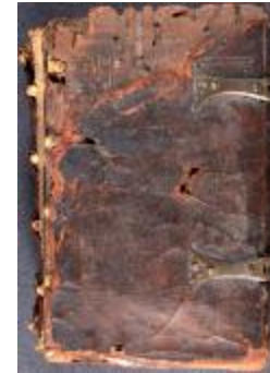
Middle Dutch Psalter (MS 0146-001)