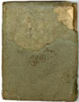
September Term 1822 (MS 0011-1822-09-001)