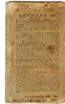
"An Account of Washington College in the State of Maryland" (WAC-003-001-01-01-001)