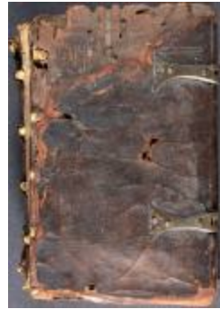
Middle Dutch Psalter cover (MS 0146-01_02)