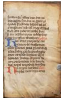
Middle Dutch Psalter Office of the Dead (MS 0146-01_05)