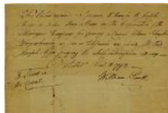
Schuylkill and Susquehanna Navigation Company note (WAC-003-001-01-19-001)