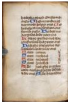
Middle Dutch Psalter litany of Saints (MS 0146-01_04)