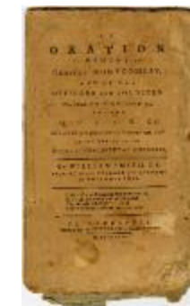
"An Oration in Memory of General Montgomery" by William Smith (WAC-003-001-01-13-001)