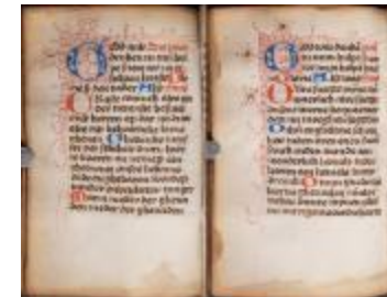
Middle Dutch Psalter illuminated initials (MS 0146-01_07)