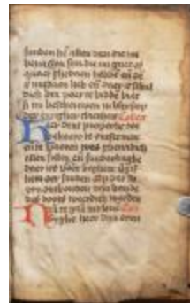
Middle Dutch Psalter Office of the Dead (MS 0146-01_05)