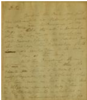
William Paca letter (MS 0039-01-01-001)