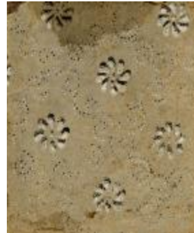
History notebook (MS 0025-01-01-001)