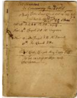
Two sermons on Overcoming the World (WAC-003-001-01-20-001)