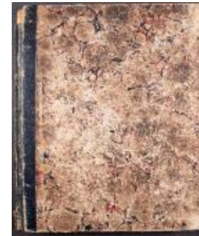
Commonplace book (WAC-003-001-07-10-001)