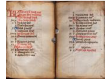
Middle Dutch Psalter November calendar (MS 0146-01_03)