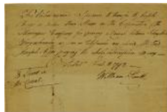
Schuylkill and Susquehanna Navigation Company note (WAC-003-001-01-19-001)