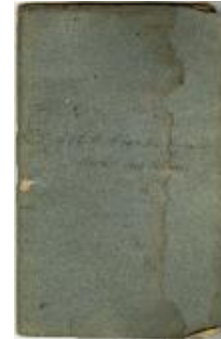
Ezekiel F. Chambers Esquire Docket May Term 1824 (MS 0011-1824-05-001)