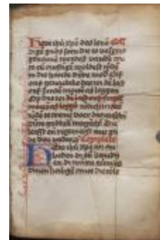
Middle Dutch Psalter, edits (MS 0146-01_06)