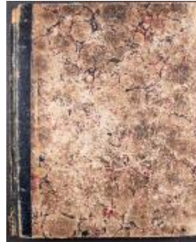
Commonplace book (WAC-003-001-07-10-001)