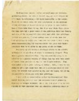
Typescript of Eleanor Roosevelt's commencement address (MS 0059-13-13-006)