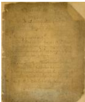
Dedication of Washington College (WAC-003-001-01-06-001)