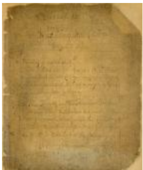
Dedication of Washington College (WAC-003-001-01-06-001)