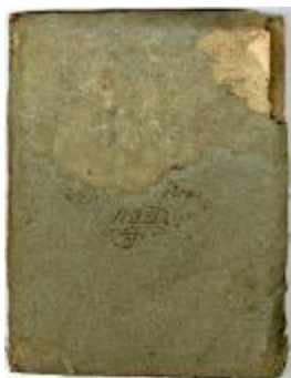
September Term 1822 (MS 0011-1822-09-001)