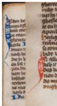
Middle Dutch Psalter figures (MS 0146-01_08)