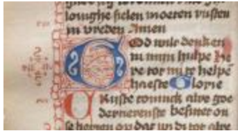
Middle Dutch Psalter illuminated Capital (MS 0146-01_01)