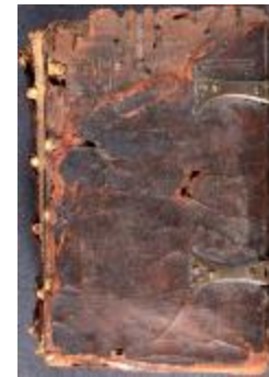
Middle Dutch Psalter (MS 0146-001)