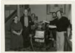
Washington College Literary House Press (MS 0061-25-04-005)