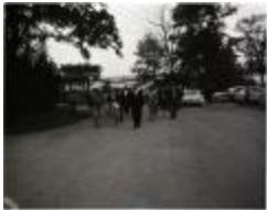
Walking to the College (MS 0045-258)