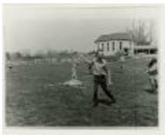
May Day celebration (MS 0061-07-14-002)