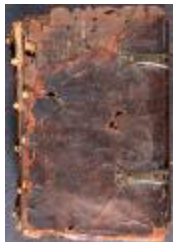
Middle Dutch Psalter (MS 0146-001)