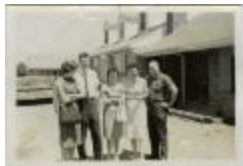
Group photo (MS 0084-01-01-0010)