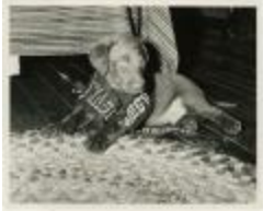
The College Mascot (MS 0061-29-04-002)