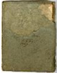
September Term 1822 (MS 0011-1822-09-001)