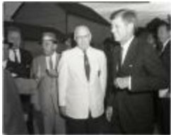
John F. Kennedy arriving in Chestertown (MS 0045-257)