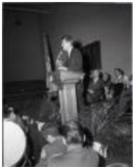
Kennedy speaking at Washington College (MS 0045-260)