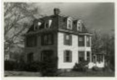
Bell House (MS 0061-25-04-004)