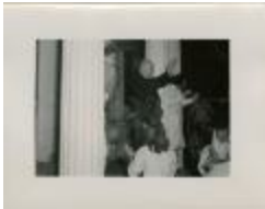
College Pep Rally (MS 0150-01-10)