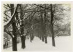
Tree-lined pathway in snow (MS_0061-25-04-048)