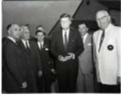
John F. Kennedy and supporters (MS 0045-256)