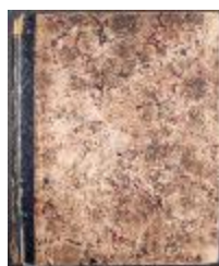
Commonplace book (WAC-003-001-07-10-001)