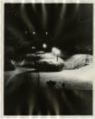
Cater Walk at night (MS_0061-22-14-061)