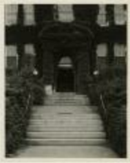
Entrance to William Smith Hall (MS 0061-25-11-053)