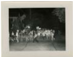
Pep rally for football game against Johns Hopkins (MS 0150-01-16)