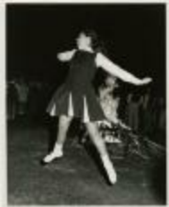
Homecoming bonfire (MS 0061-29-03-005)