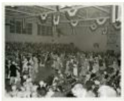
Washington's Birthday Ball (MS 0061-03-01-003)