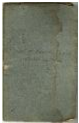
Ezekiel F. Chambers Esquire Docket May Term 1824 (MS 0011-1824-05-001)