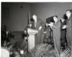
Kennedy speaking at Washington College (MS 0045-262)