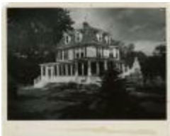
Rose O'Neill Literary House (MS 0061-25-04-012)