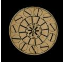
Ludoscope disc (MS 0073-01-01-012)