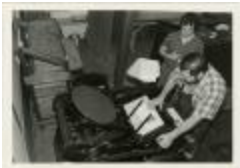
Washington College Literary House Press (MS 0061-25-04-010)