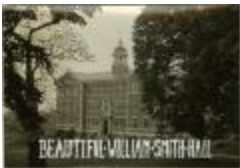
"Beautiful William Smith Hall" (MS 0061-25-11-019)