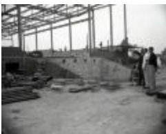
Gym construction (MS_0045-249)