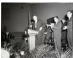
Kennedy speaking at Washington College (MS 0045-262)