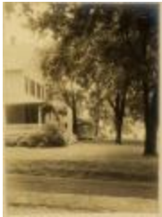
Faculty Row (MS 0061-23-13-004)