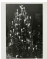
Christmas tree (MS_0061-08-09-035)