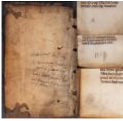
Middle Dutch Psalter flyleaves (MS 0146-01_10)