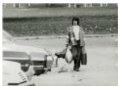
Student moving out (MS 0061-19-08-004)