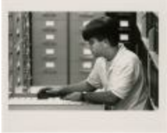
Student at microfilm collection (MS 0061-20-04-032)