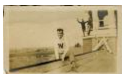
Student sitting on roof (MS 0084-01-01-005)