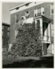
Dorm decorated for Homecoming game (MS 0061-07-15-038)