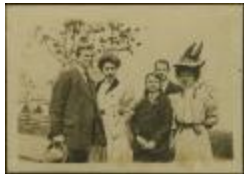
Group photograph (MS 0089-01-01-006)