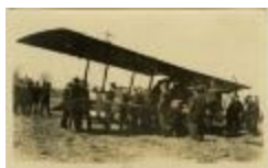
Biplane and crowd (MS 0083-01-01-005)