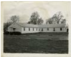
G.I. dorms (demolished) (MS 0061-23-16-007)