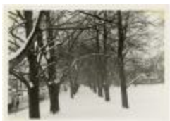
Tree-lined pathway in snow (MS_0061-25-04-048)