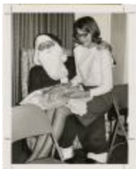
Santa and student (MS_0061-08-09-026)