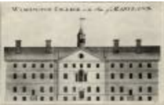
Washington College (MS0059-01-02-001)