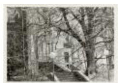
Hill Dorms during snow (MS_0061-26-16-031)