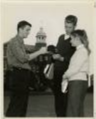
Freshman group in front of B. Smith Hall (MS 0061-06-17-006)