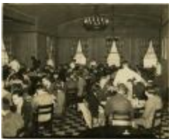
Mealtime at Hodson Hall (MS 0061-26-18-005)