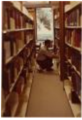
Student in the stacks (MS 0061-24-14-003)