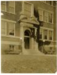
William Smith Hall (MS 0061-25-11-047)