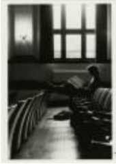
Student in auditorium (MS 0061-20-04-001)