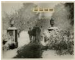
Students walking through snow (MS_0061-19-07-102)