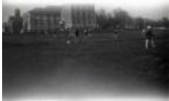
Lacrosse game (MS 0118-028)