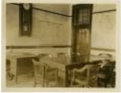
President's Office (MS 0061-24-18-001)