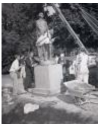
George Washington statue construction (MS_0045-267)