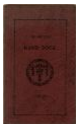
Washington College Freshman Hand Book, 1924-1925 (Freshman_Handbook_1924-1925)