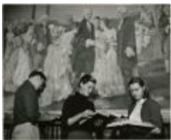
Students reading in Bunting Library (MS 0061-24-11-010)