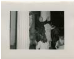
College Pep Rally (MS 0150-01-10)