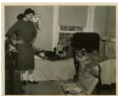
Student standing in her dorm room (MS 0061-19-04-004)