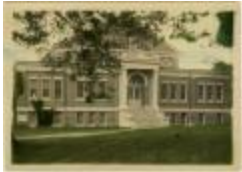
Cain Gym (MS 0061-22-11-007)