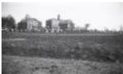
Baseball game (MS 0118-011)