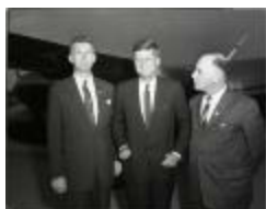
John F. Kennedy (MS 0045-255)