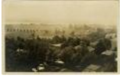
Aerial view of campus (MS 0083-01-01-009)