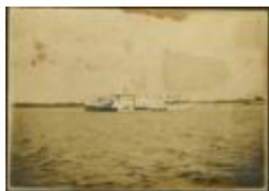
Boat coming in to harbor (MS 0089-01-01-007)