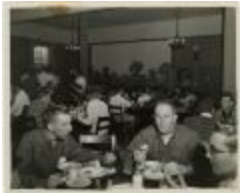
Students in Hodson Hall (MS 0061-26-18-007)