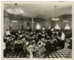
Hodson Hall, family style (MS 0061-26-18-008)