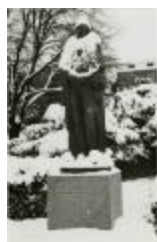
George Washington statue in snow (MS_0061-08-09-033)