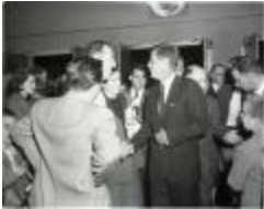
Kennedy shaking hands (MS 0045-265)