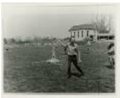
May Day celebration (MS 0061-07-14-002)