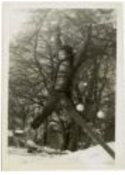
Ski jump (MS_0061-08-14-006)