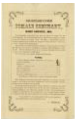
Chestertown Female Seminary advertisement (MS 0091-01-01-001)