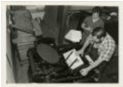
Washington College Literary House Press (MS 0061-25-04-010)