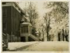
Hill Dorms in the snow (MS_0061-23-21-038)