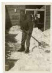
Man shoveling snow (MS_0061-25-04-102)