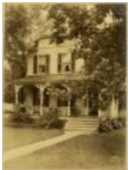
Vice Principal's House (MS 0061-23-13-005)