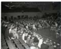
Crowd waiting to hear speech (MS 0045-259)