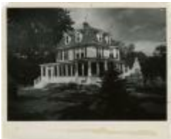
Rose O'Neill Literary House (MS 0061-25-04-012)