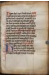
Middle Dutch Psalter, edits (MS 0146-01_06)