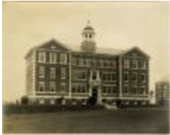
William Smith Hall (MS 0061-25-11-050)