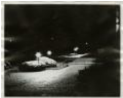
Night snow (MS_0061-22-14-060)