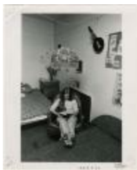
Student reads in her dorm room (MS 0061-19-04-007)