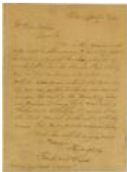
Rembrandt Peale letter, forgery (MS 0116-01-01-001)