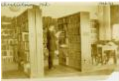
Library in William Smith Hall (MS 0061-25-12-001)