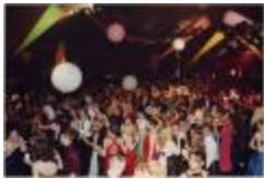
Washington's Birthday Ball (MS 0061-03-01-022)