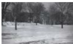
Snow on the campus green (MS 0118-006)