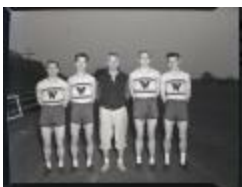
Relay Team (MS 0150-01-28)