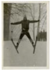
Student skiing in front of crowd (MS_0061-08-14-012)