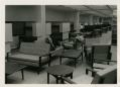
Second floor of Miller Library (MS 0061-24-14-025)