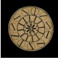
Ludoscope disc (MS 0073-01-01-012)