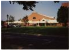
Cain Athletic Center (MS 0061-22-09-011)