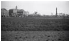
Baseball game (MS 0118-012)