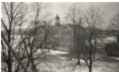
William Smith Hall in the snow (MS_0119-01-082)