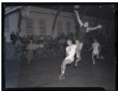
Basketball game (MS 0150-01-24)