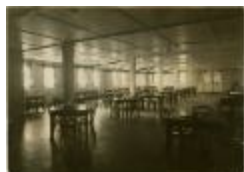
Dining hall in basement of Cain Gym (MS 0061-22-11-026)