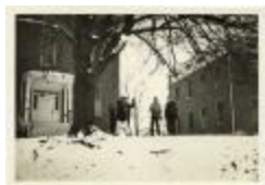
Students outside West Hall in the snow (MS_0061-08-09-030)