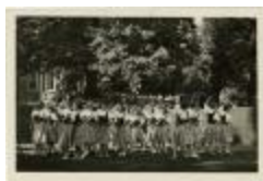
Costumed students dance (MS 0061-09-07-003)