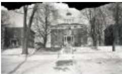
Hill Dorms in the snow (MS_0119-01-073)