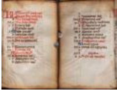
Middle Dutch Psalter November calendar (MS 0146-01_03)