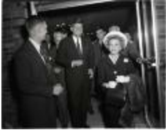
Kennedy leaving his speech at Washington College. (MS 0045-264)