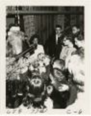
Visit from Santa Claus (MS_0061-08-09-028)