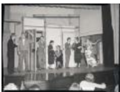
Washington Players production of The Torch-Bearers (MS 0150-01-19)