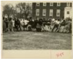
Students play Tug-of-War (MS 0061-10-04-008)