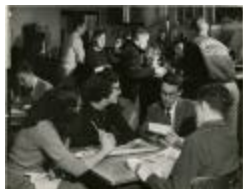
Students at lunch (MS 0061-19-06-012)