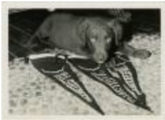
The College Mascot (MS 0061-29-04-001)