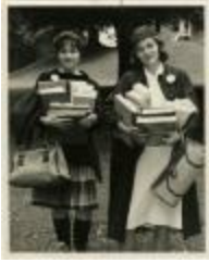
Two students during Freshman Week (MS 0061-06-17-005)