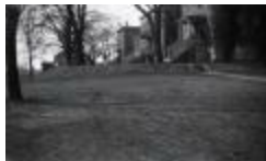
Hill Dorms (MS 0118-002)