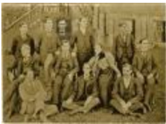
Class of 1895 (MS 0061-18-17-003)