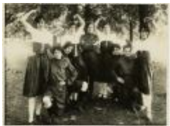
National Dance Pageant (MS 0061-09-07-001)