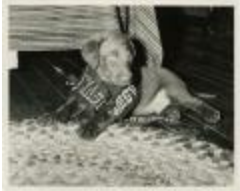
The College Mascot (MS 0061-29-04-002)