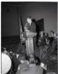
Kennedy speaking at Washington College (MS 0045-260)