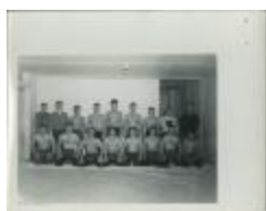
Wrestling Team (MS 0150-01-29)