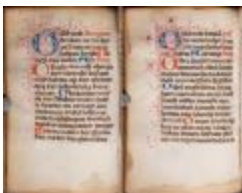
Middle Dutch Psalter illuminated initials (MS 0146-01_07)