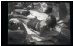
Washington College students at the Chester River Yacht and Country Club (MS 0150-01-20)