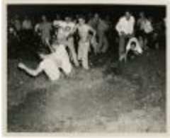
Students playing Tug-of-War (MS 0061-10-04-003)