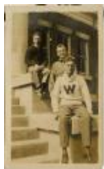
Three students on steps (MS 0084-01-01-004)