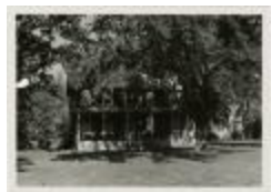
McAlpin House (demolished) (MS 0061-24-13-001)