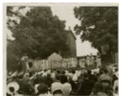
Students on pageant stage (MS 0061-09-07-004)