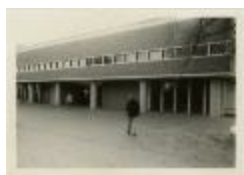
Clifton M. Miller Library (MS 0061-24-14-006)