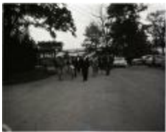
Walking to the College (MS 0045-258)