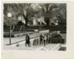
Miller Library Move (MS 0061-09-03-001)