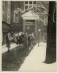
Students leaving William Smith Hall during snow (MS_0061-08-09-036)