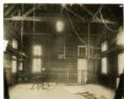
Cain Gym, interior (MS 0061-22-11-024)