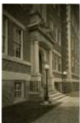
Entrance to William Smith Hall (MS 0061-25-11-026)