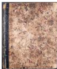
Commonplace book (WAC-003-001-07-10-001)