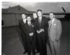
John F. Kennedy (MS 0045-254)