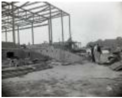
Gym construction and onlookers (MS_0045-250)