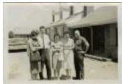
Group photo (MS 0084-01-01-0010)