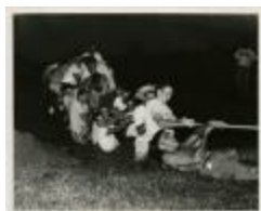
Students playing Tug-of-War (MS 0061-10-04-001)