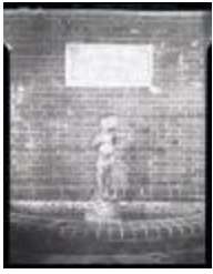
Statue that once stood in front of Dunning Hall. (MS 0150-01-02)