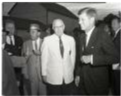
John F. Kennedy arriving in Chestertown (MS 0045-257)