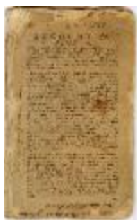
"An Account of Washington College in the State of Maryland" (WAC-003-001-01-01-001)