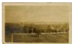
Campus landscape (MS 0084-01-01-007)