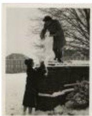
Students building snowman (MS_0061-08-09-029)