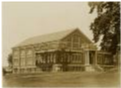
Cain Gym (MS 0061-22-11-008)