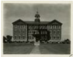
William Smith Hall (MS 0061-25-11-060)