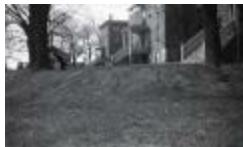
Hill Dorms (MS 0118-003)