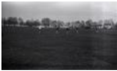
Lacrosse game (MS 0118-029)