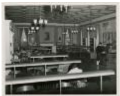
George A. Bunting Library (MS 0061-24-11-012)