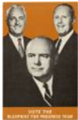
"Vote the Blueprint for Progress Team" postcard (MS 0162-01-01-001)