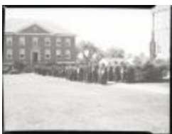
Graduation exercises (MS 0150-01-11)