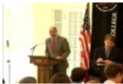
The Senatorial Colloquy on American History and Politics at Washington College, Session 02 (MS 0058_2007-2008_Senate_02)