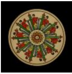
Ludoscope disc (MS 0073-01-01-004)