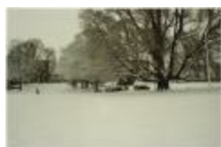
Campus green in the snow (MS_0061-25-04-024)