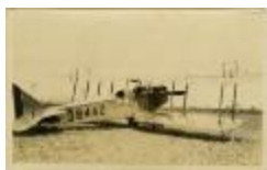
Biplane 38442 on campus (MS 0083-01-01-001)