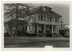
Richmond House (demolished) (MS 0061-25-03-001)