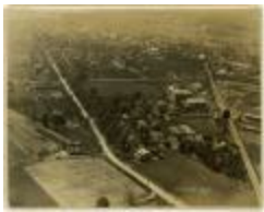
Aerial view of Washington College campus (MS 0061-22-02-006)