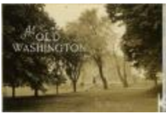
"At Old Washington" (MS 0061-25-11-021)