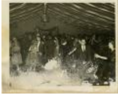
Students at Homecoming dance (MS 0061-07-15-016)