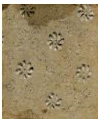
History notebook (MS 0025-01-01-001)