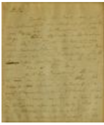
William Paca letter (MS 0039-01-01-001)