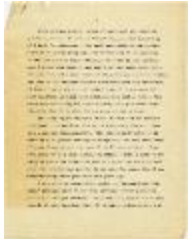
Typescript of Eleanor Roosevelt's commencement address (MS 0059-13-13-006)