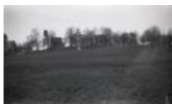
Hill Dorms and the campus green (MS 0118-004)