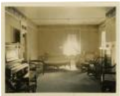
Social Room in Reid Hall (MS 0061-24-19-011)