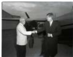
John F. Kennedy, arrives in Chestertown (MS 0045-253)