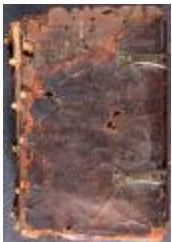
Middle Dutch Psalter (MS 0146-001)