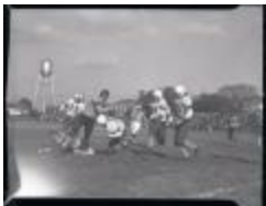
Randolph-Macon vs. Washington College football game (MS 0150-01-27)