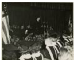
Eleanor Roosevelt giving the commencement address (MS 0061-03-17-008)