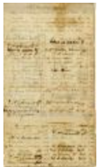
Jane Stuart painting raffle list (MS 0081-01-01-001)