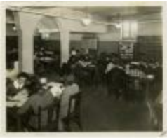
Library in the basement of William Smith Hall (MS 0061-25-12-002)