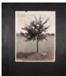
Washington College sesquicentennial photo album (MS 0085-001)