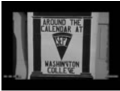
"Around the Calendar" (MS 0058-1932-001)