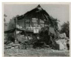
Demolition of Cain Gym (MS 0061-22-12-003)