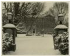
William Smith Hall in the snow (MS_0061-25-11-069)