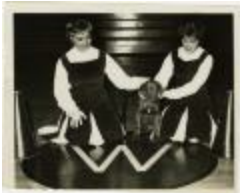
The College Mascot (MS 0061-29-04-003)