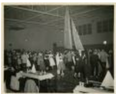
Homecoming dance (MS 0061-07-15-011)