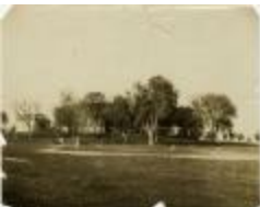
Athletic field prior to 1906 (MS 0061-22-04-002)