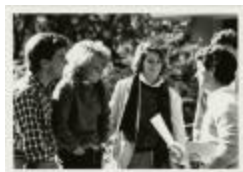
Group of students on campus (MS 0061-20-01-011)