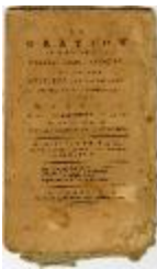
"An Oration in Memory of General Montgomery" by William Smith (WAC-003-001-01-13-001)