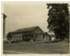
Cain Gym (MS 0061-22-11-018)