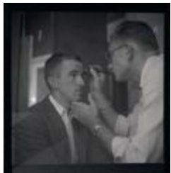
The Washington Players (MS 150-01-08)