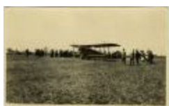
Biplane in a field (MS 0083-01-01-007)