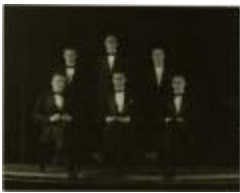
Cotillion Club Committee (MS 0061-11-23-001)