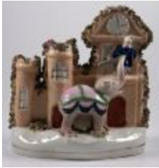
Pink elephant themed ceramic (MS 0029-A006)