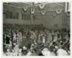
Washington's Birthday Ball (MS 0061-03-01-003)