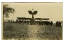
Biplane, rear view (MS 0083-01-01-006)