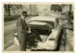
Student with suitcase in front of car (MS 0061-19-07-067)