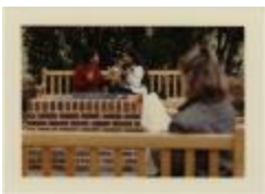
Students on Cater Walk (MS 0061-20-02-064)