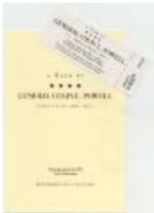
Program and ticket for Colin Powell speech (MS 0059-65-16-Ticket and program)