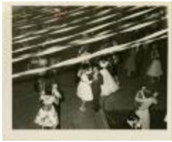
Aerial view of Homecoming dance (MS 0061-07-15-015)