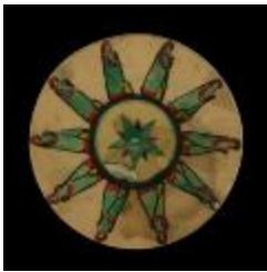
Ludoscope disc (MS 0073-01-01-014)