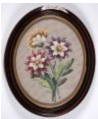
Framed floral needlepoint (MS 0029-A004)