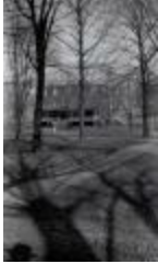
Reid Hall (MS 0118-008)