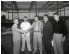
Group of men in front of gym construction (MS_0045-251)