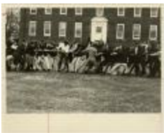
Students playing Tug-of-War (MS 0061-10-04-007)