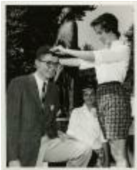
Student crowned with Washington College hat (MS 0061-06-17-008)