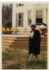
Toni Morrison at the Rose O'Neill Literary House (MS 0061-17-05-008)