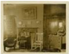
Typical Room in Reid Hall (MS 0061-24-19-012)