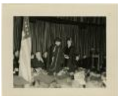
Anna Eleanor Roosevelt receiving her honorary doctorate of law