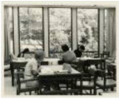
Students in Miller Library (MS 0061-24-14-050)