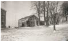
Building in the snow (MS_0119-01-067)