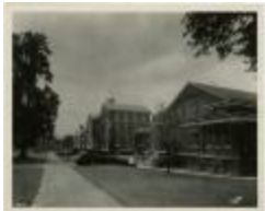
Cain Gym (MS 0061-22-11-019)