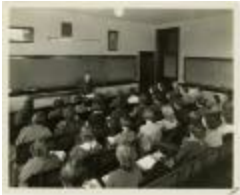
Students attending a lecture (MS 0061-19-01-019)