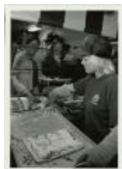
Pizza in the Dining Hall (MS 0061-26-18-009)