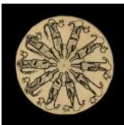
Ludoscope disc (MS 0073-01-01-011)