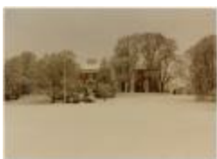
View north from Campus Ave. of South Campus (MS_0061-25-04-051)