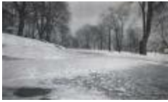
Snow covering the campus green (MS 0118-007)