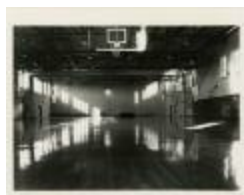
Cain Gym, interior (MS 0061-22-11-025)