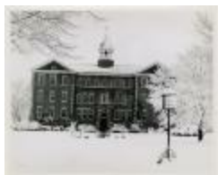
William Smith Hall in the snow (MS_0061-08-09-037)