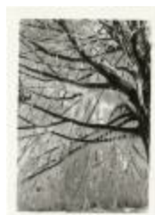
Icicles on a tree (MS_0061-25-04-012)