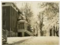
Hill Dorms in the snow (MS_0061-26-16-046)