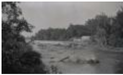
Unidentified location (MS 0118-009)