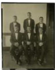
Cotillion Club Committee (MS 0061-11-23-002)