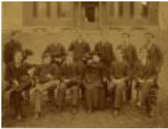
Class of 1895 (MS 0061_OS_class of 1895)