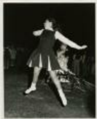
Homecoming bonfire (MS 0061-29-03-005)