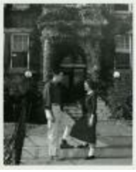
Two students on campus (MS 0061-18-21-025)