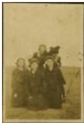
Washington College Normal department students and their friends (MS 0089-01-01-005)