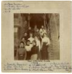
Co-Eds of Washington College (MS 0061-18-17-004)