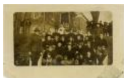
Washington College football team (MS 0084-01-01-001)