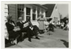
Toni Morrison and Rev. Benjamin Hooks at the Rose O'Neill Literary House (MS 0061-17-05-004)