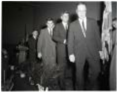
Kennedy leaving the stage (MS 0045-263)