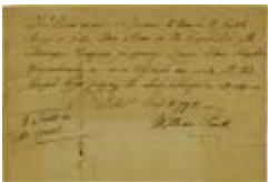
Schuylkill and Susquehanna Navigation Company note (WAC-003-001-01-19-001)