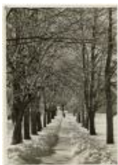
"The Walk" in the snow (MS_0061-25-04-060)