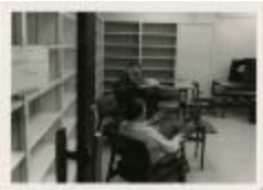
Smoking area (MS 0061-24-14-026)