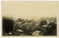
Aerial view of Washington College, from biplane (MS 0083-01-01-008)