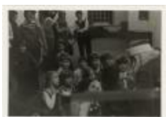
Santa Claus and children (MS_0061-28-09-025)