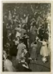
Students dancing at Homecoming (MS 0061-07-15-043)