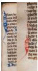
Middle Dutch Psalter figures (MS 0146-01_08)