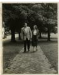
'The Walk' on Washington College Campus (MS 0061-18-21-024)