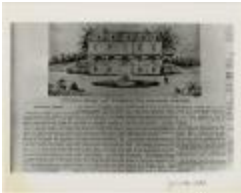
News Article on "Normal Hall" (MS 0061-24-19-007)