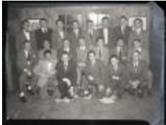
Kappa Alpha banquet (MS 0150-01-04)