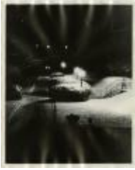
Cater Walk at night (MS_0061-22-14-061)