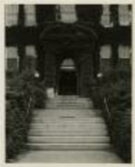
Entrance to William Smith Hall (MS 0061-25-11-053)