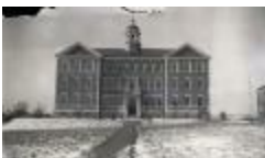
William Smith Hall in the snow (MS_0119-01-083)