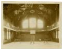
Cain Gym, interior (MS 0061-22-11-023)