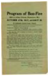
Program of Bon-Fire (MS 0173-01-001)