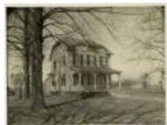
Hodson House/Phi Sigma Phi House (MS 0061-24-03-001)