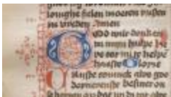
Middle Dutch Psalter illuminated Capital (MS 0146-01_01)