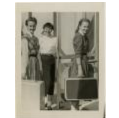
Three students during Freshman Week (MS 0061-06-17-001)