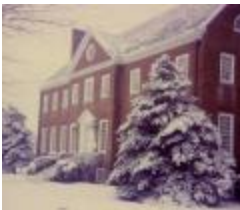
Bunting Hall in snow (MS_0061-22-14-010)