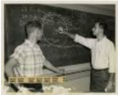
Spanish class (MS 0061-19-01-029)