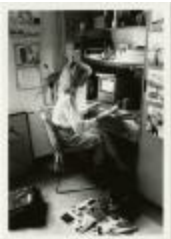
Student in her dorm room (MS 0061-19-04-001)