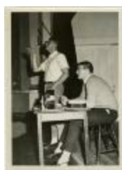
Two students at Senior Auction (MS 0061-09-18-002)