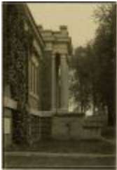
Entrance to Cain Gym (MS 0061-22-11-011)