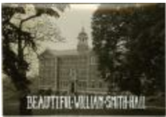
"Beautiful William Smith Hall" (MS 0061-25-11-019)