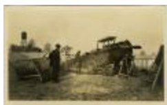
Biplane repairs (MS 0083-01-01-003)