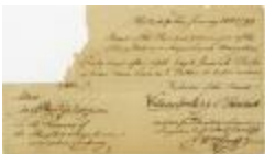
Schuylkill and Susquehanna Navigation Company receipt (WAC-003-001-01-19-002)