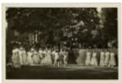
Costumed students dance at pageant (MS 0061-09-07-002)