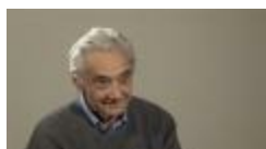
Howard Zinn oral history interview (NHF_BNYDC_2008_Zinn_Howard)