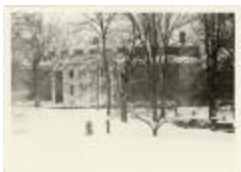
Reid Hall in the snow (MS_0061-25-04-054)