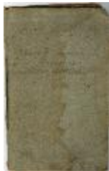
Ezekiel F. Chambers Esq. Docket to May Term 1826 (MS 0011-1826-05-001)