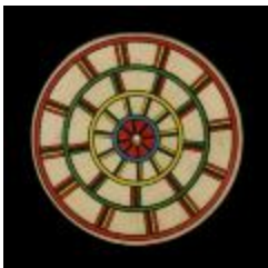
Ludoscope disc (MS 0073-01-01-003)