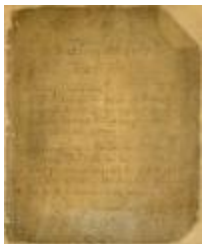
Dedication of Washington College (WAC-003-001-01-06-001)