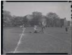
Fraternity stunt during Homecoming football game (MS 0150-01-14)