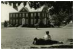
Bunting Hall (MS 0061-22-07-020)