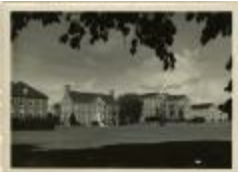
Dunning, Bunting, and William Smith Halls (MS 0061-22-14-036)