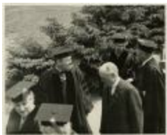
1942 commencement (MS 0061-03-17-005)