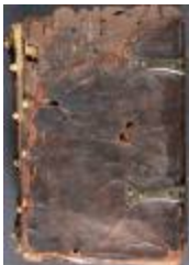
Middle Dutch Psalter cover (MS 0146-01_02)