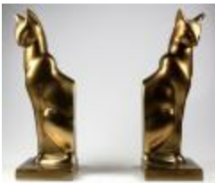
Brass cat bookends (MS 0029-A001)