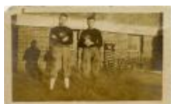
Two football players (MS 0084-01-01-003)