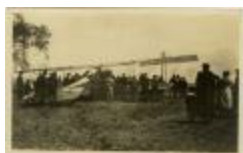
Rear view of biplane (MS 0083-01-01-004)