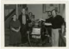
Washington College Literary House Press (MS 0061-25-04-005)