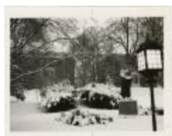
View of Hill Dorms and Washington statue in the snow (MS_0061-25-04-047)