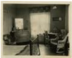
Room in Reid Hall (MS 0061-24-19-010)