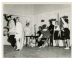
"Alice in Wonderland" at Stunt Night (MS 0061-09-18-018)