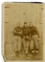
Three football players (MS 0084-01-01-002)