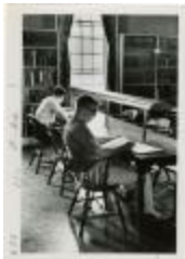
Students studying in Bunting Library (MS 0061-24-11-006)