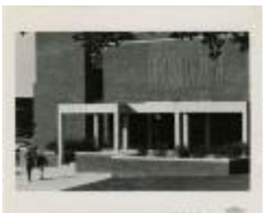
Gibson Fine Art Center (MS 0061-23-18-013)