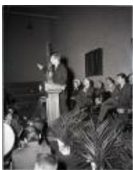
Kennedy speaking at Washington College (MS 0045-261)