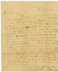
John Emory letter (MS 0019-01-01-001)