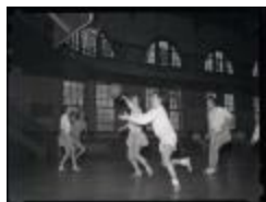
Girls Basketball (MS 0150-01-25)