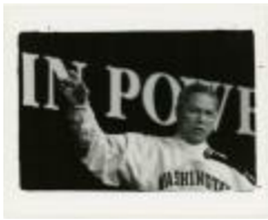
Colin Powell speaking (MS 0061-17-19-006)