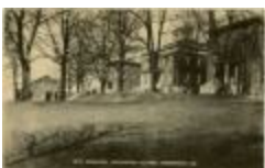
"Boys' Dormitory" (MS 0061-23-21-004)