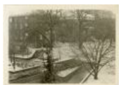
View of Hill Dorms in the snow (MS_0061-26-16-015)