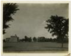
College lawn, circa 1920 (MS 0061-22-14-057)