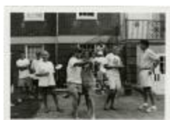
Students hanging out in front of dorm (MS 0061-20-01-014)