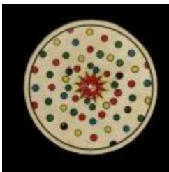
Ludoscope disc (MS 0073-01-01-007)