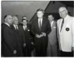
John F. Kennedy and supporters (MS 0045-256)