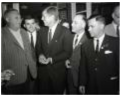
John F. Kennedy at Washington College (MS 0045-266)