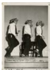
Fraternity brothers at Stunt Night (MS 0061-09-18-012)