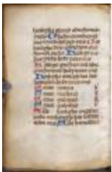
Middle Dutch Psalter litany of Saints (MS 0146-01_04)