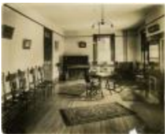
Parlor of Normal Hall (MS 0061-24-19-008)