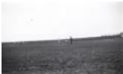
Baseball game (MS 0118-010)