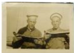
Two men in "dixie cup" hats eating watermelon (MS 0084-01-01-009)