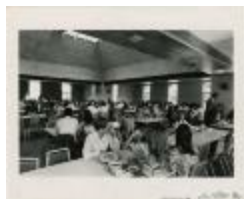
Students in the Dining Hall (MS 0061-26-18-023)