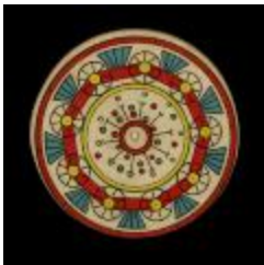
Ludoscope disc (MS 0073-01-01-002)