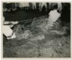
Freshmen-Sophomore Fall Tug-of-War (MS 0061-10-04-002)