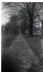
Walkway (MS 0118-005)