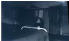
Men's dorm room (MS 0118-001)