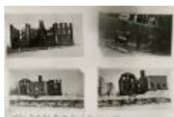
William Smith Hall after the fire of January 1916