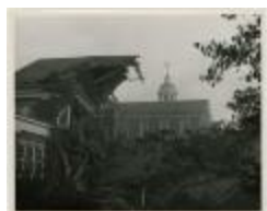
Demolition of Cain Gym (MS 0061-22-12-001)