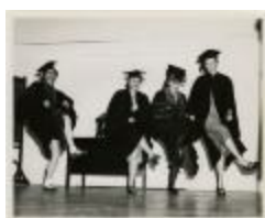
Faculty Stunt Night (MS 0061-09-18-023)