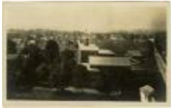
Aerial view of campus (MS 0083-01-01-010)