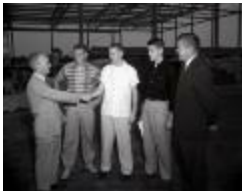
Close-up of men in front of gym construction project (MS_0045-252)