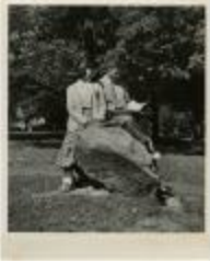
Students at "the Rock"