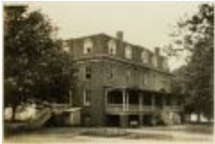
Reid Hall (MS 0061-24-19-003)