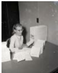
Woman with 175th Anniversary programs (MS_0045-232)