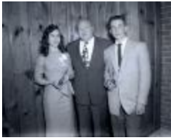
Awards ceremony (MS_0045-160)