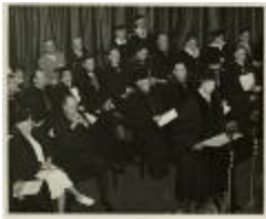
Eleanor Roosevelt giving the commencement address (MS 0061-03-17-011)