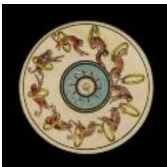
Ludoscope disc (MS 0073-01-01-008)