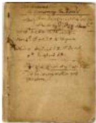
Two sermons on Overcoming the World (WAC-003-001-01-20-001)