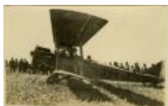
Biplane 38442, side view (MS 0083-01-01-002)