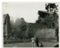
Demolition of Cain Gym (MS 0061-22-12-004)