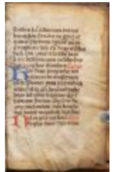
Middle Dutch Psalter Office of the Dead (MS 0146-01_05)