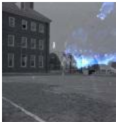
Tennis match (MS_0045-269)