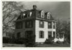
Bell House (MS 0061-25-04-004)