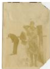
On the dock (MS 0084-01-01-008)