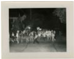
Pep rally for football game against Johns Hopkins (MS 0150-01-16)