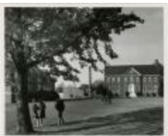
Dunning and Bunting Halls (MS 0061-22-14-049)