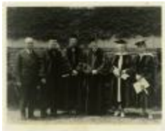
1942 commencement honorees (MS 0061-03-17-004)