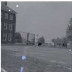
Tennis player (MS_0045-268)