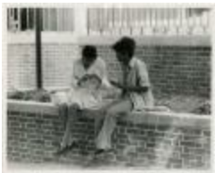
Students on Campus (MS 0061-19-08-042)