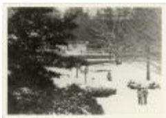
A couple in the snow (MS_0061-25-04-058)