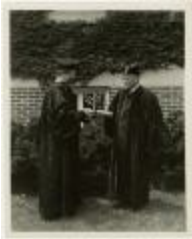
Anna Eleanor Roosevelt with her honorary degree (MS 0061-03-17-003)