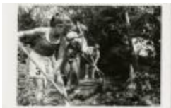
Students during Casey Time (MS 0061-03-03-021)