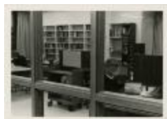
Students in Miller Library (MS 0061-24-14-024)