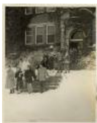
Students leaving William Smith Hall (MS_0061-21-10-012)