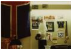
Dorm wall (MS 0061-19-04-002)