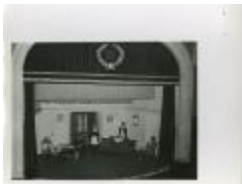
Production of Night Must Fall by Washington Players (MS 0150-01-17)